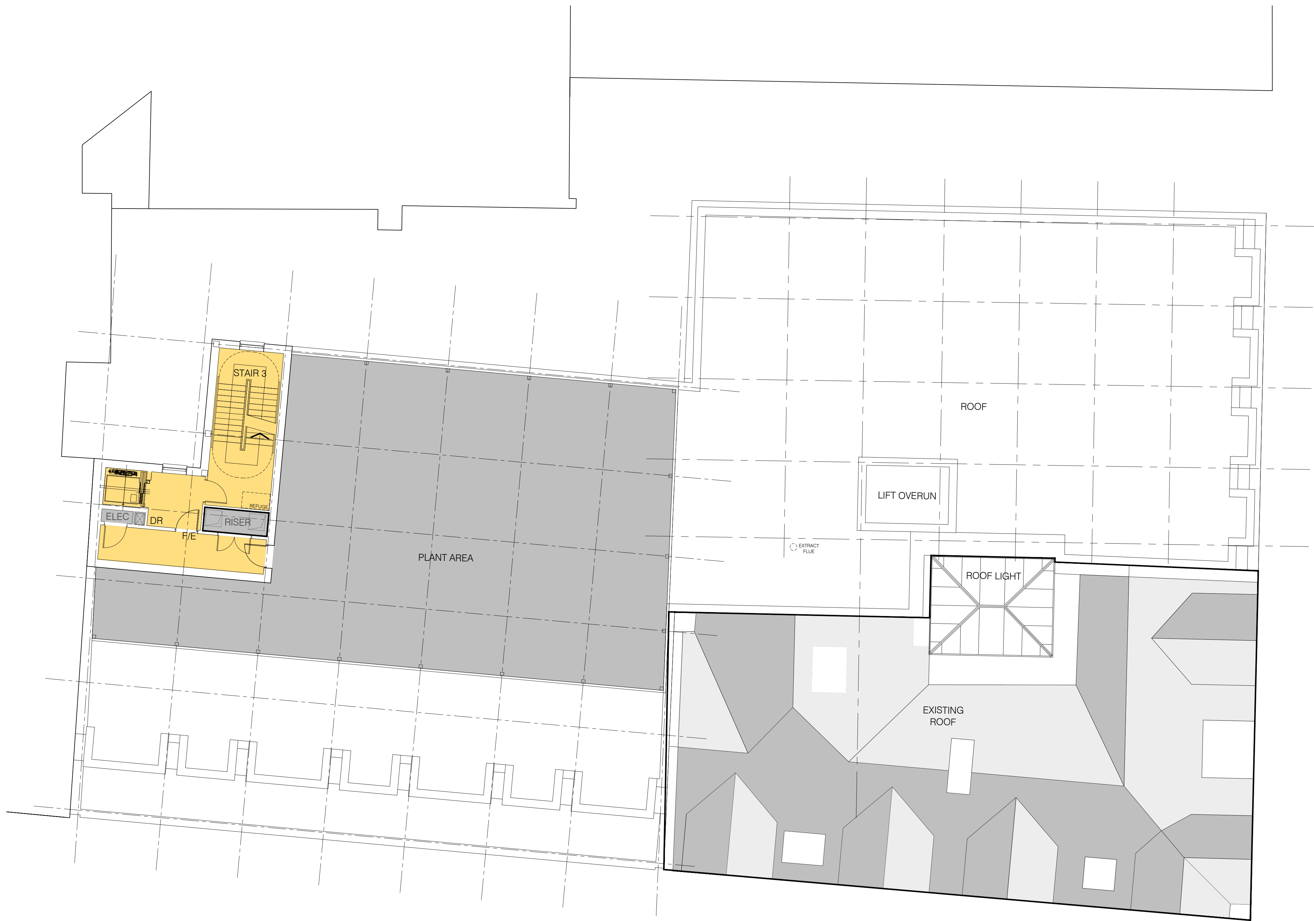
ROOF FLOOR PLAN - AS PROPOSED 1:100