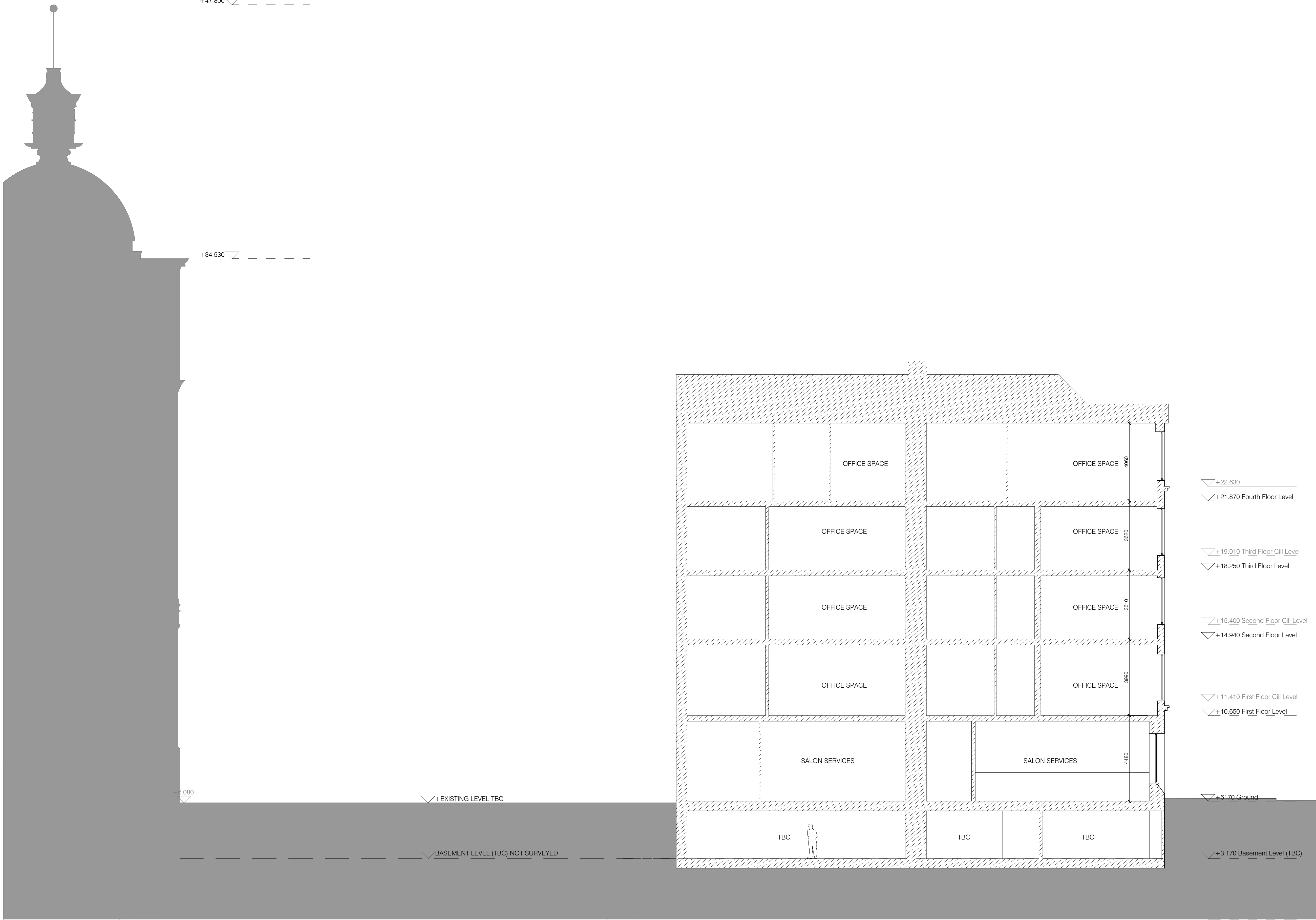
SECTION BB - AS EXISTING 1:100