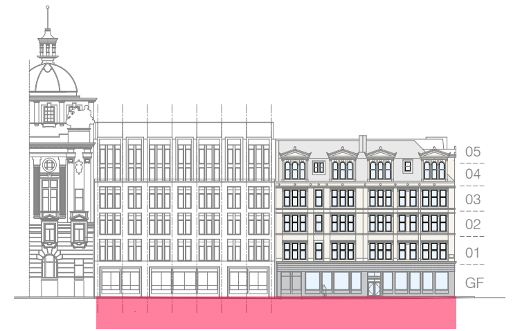
FLOOR LEVELS NTS

Please do not scale from this drawing. All dimensions should be checked on site prior to commencing construction work. If in doubt please ask.