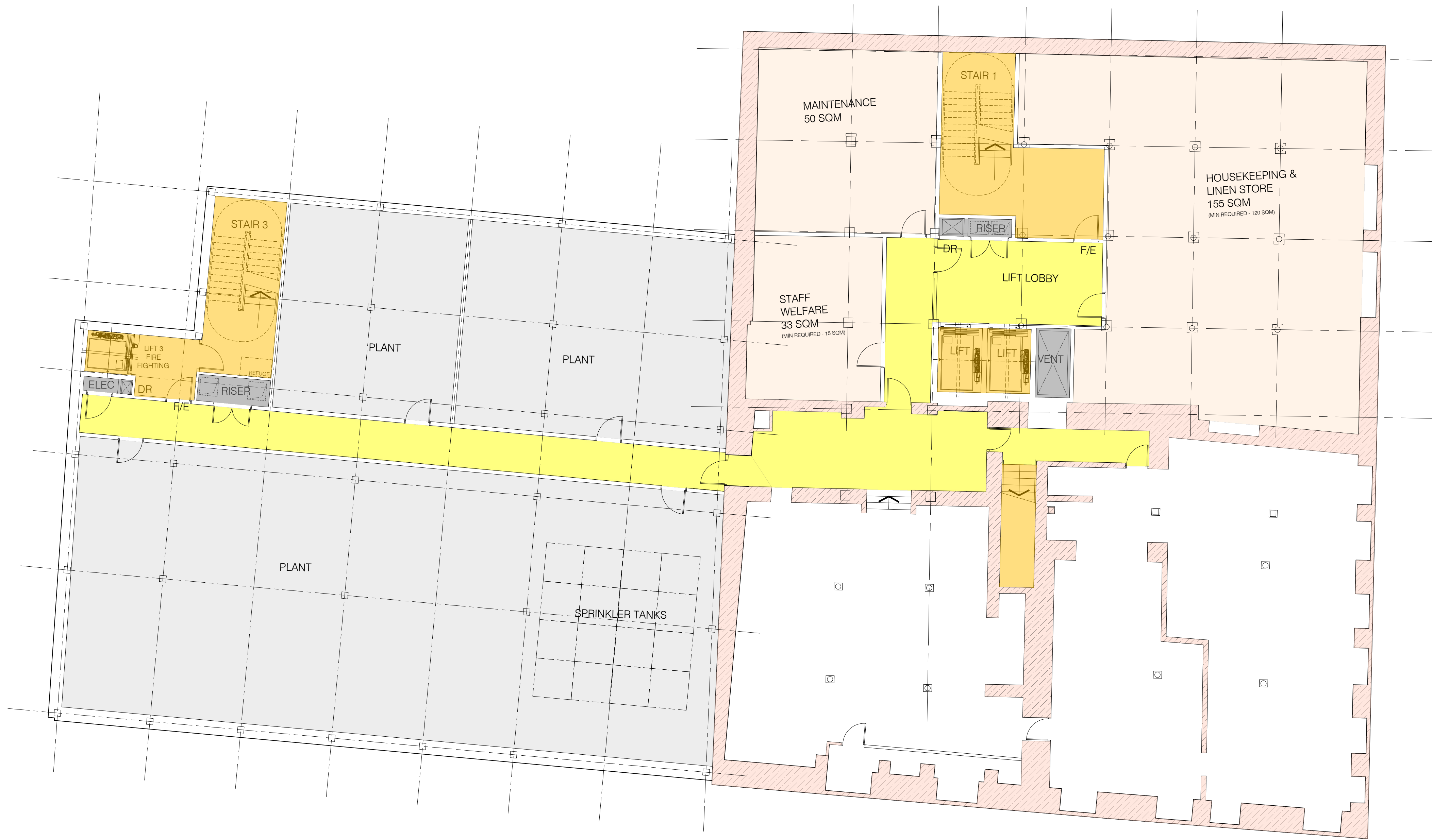
BASEMENT FLOOR PLAN - AS PROPOSED 1:100