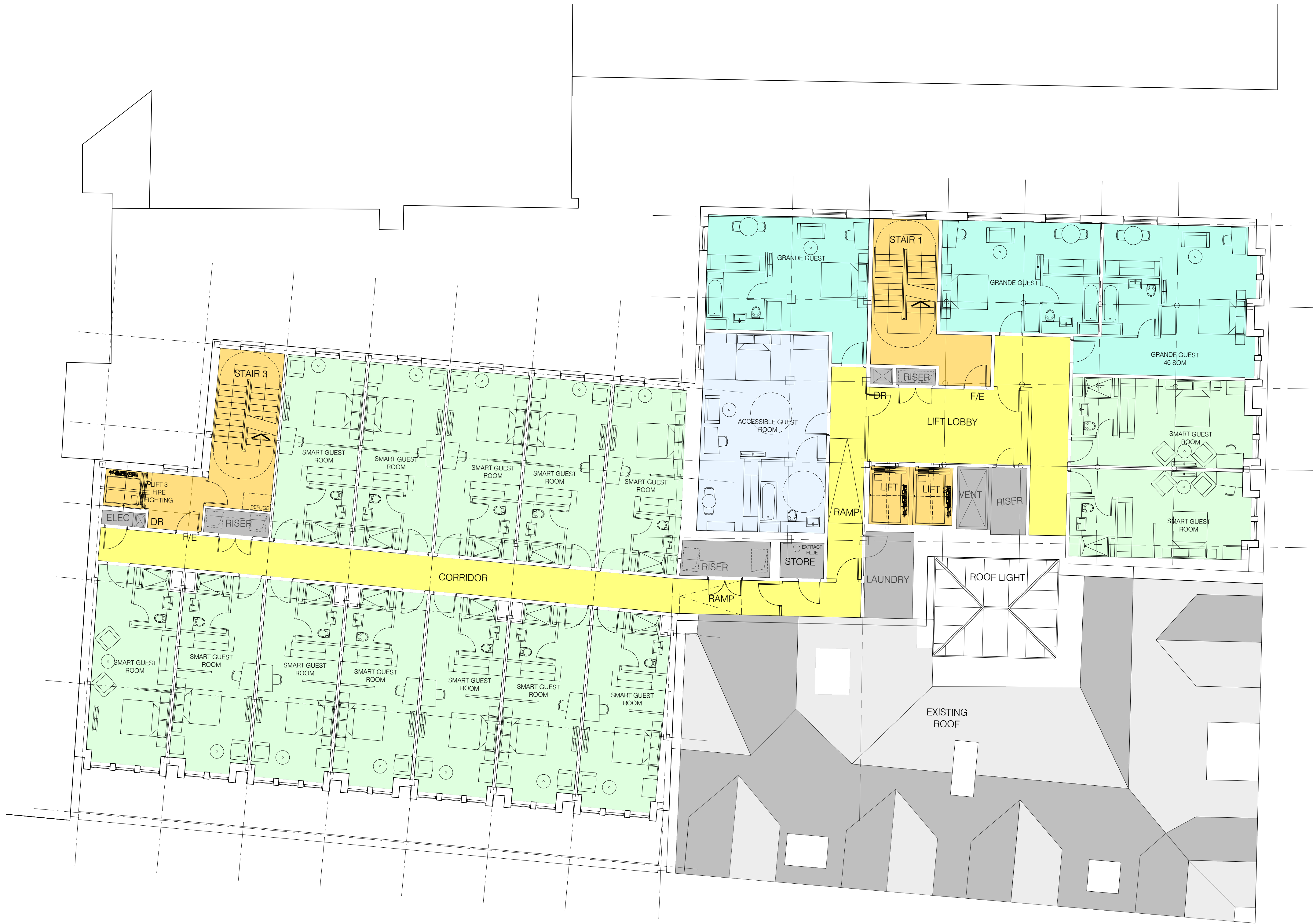
FIFTH FLOOR PLAN - AS PROPOSED 1:100