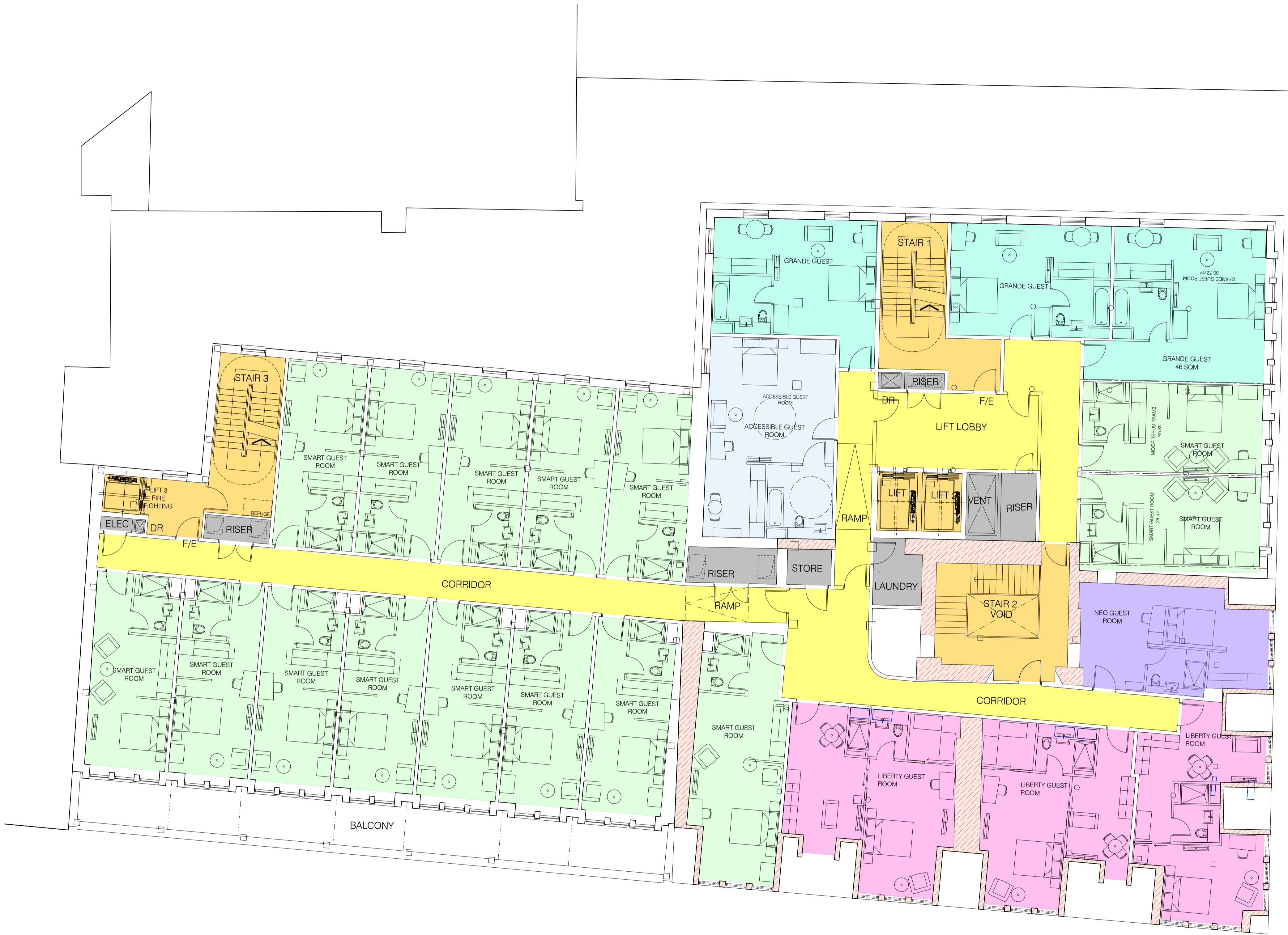
FOURTH FLOOR PLAN - AS PROPOSED 1:100