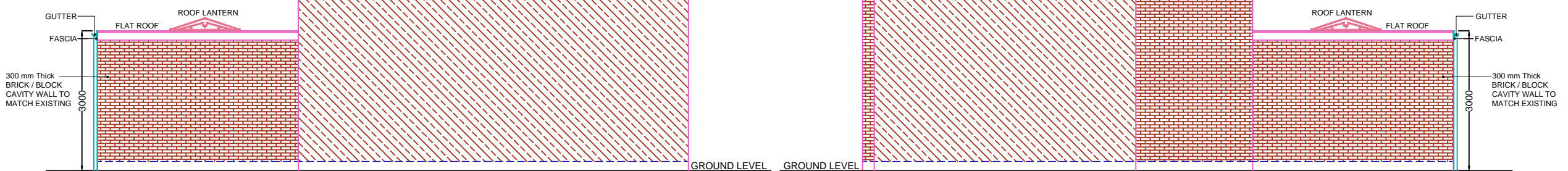
PROPOSED ELEVATION SIDE A

MATERIALS USED IN EXTERIOR WORK TO BE SIMILAR IN APPEARANCE TO THOSE OF THE EXTERIOR OF THE EXISTING HOUSE.