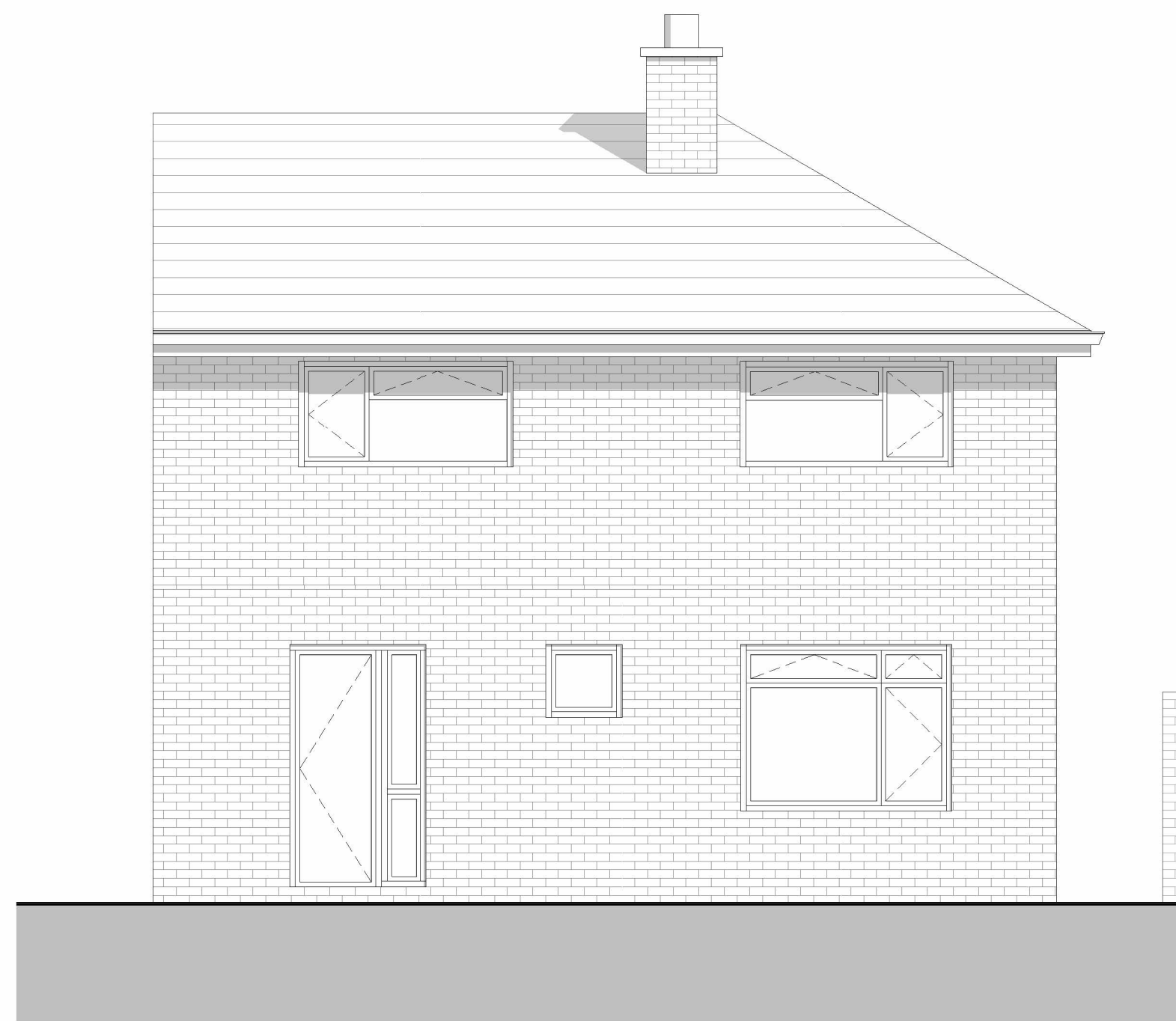
Front Elevation 1 : 50