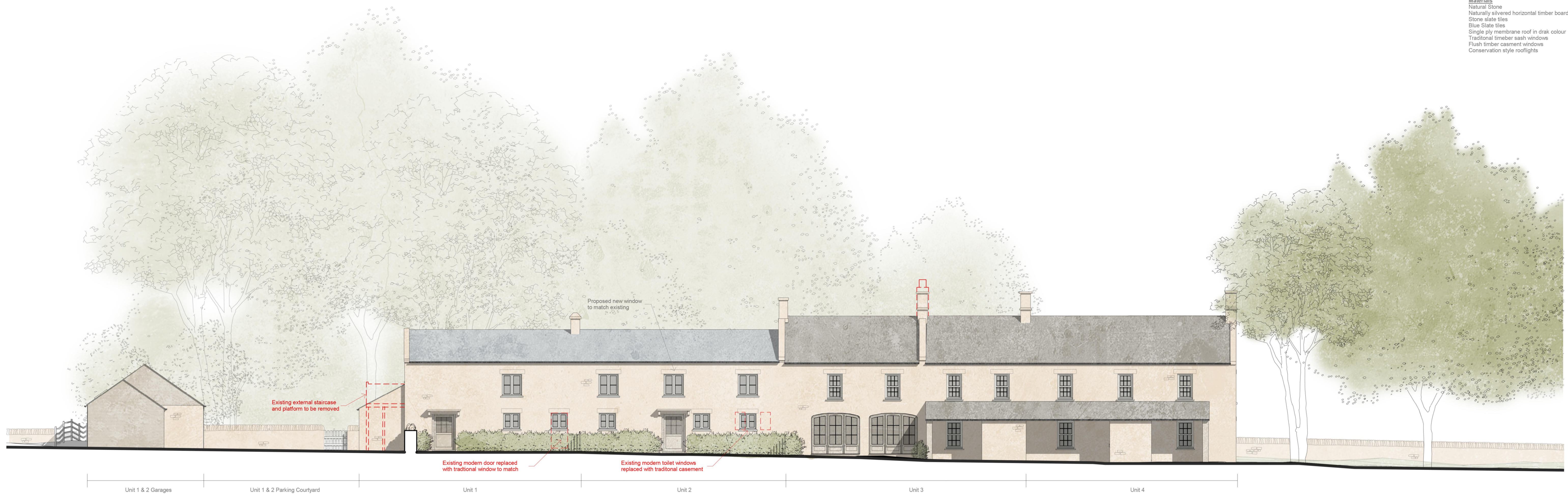
Proposed South West

Materials Natural Stone Naturally silvered horizontal timber boarding Stone slate tiles Blue Slate tiles Single ply membrane roof in drak colour Traditional timber sash windows Flush timber casement windows Conservation style rooflights