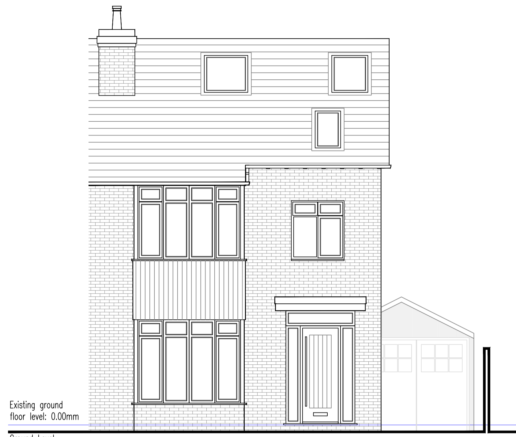
FRONT ELEVATION (as existing)