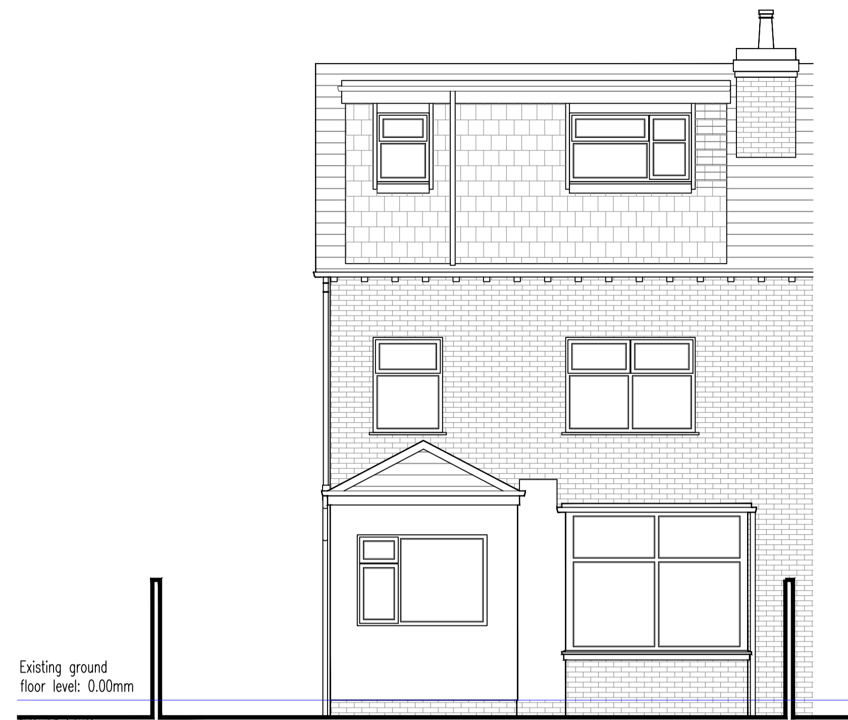
REAR ELEVATION (as existing)