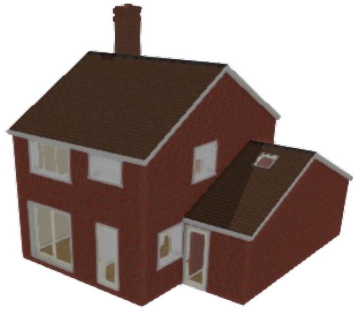
3D VIEWS NOT TO SCALE