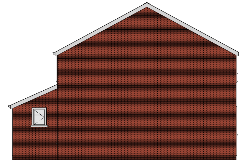
EXISTING SIDE ELEVATION (WEST FACING)