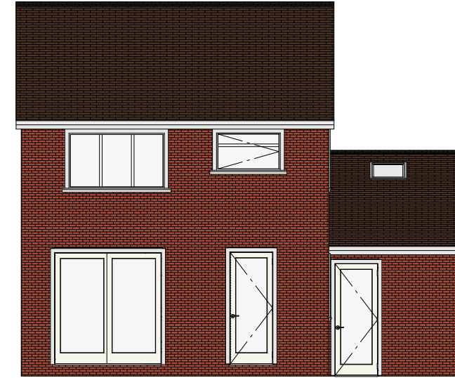
EXISTING REAR ELEVATION (SOUTH FACING)