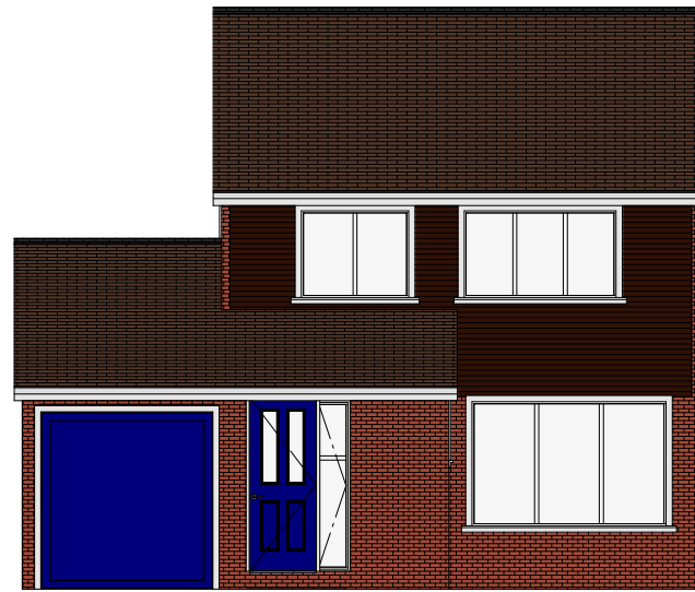
EXISTING FRONT ELEVATION (NORTH FACING)