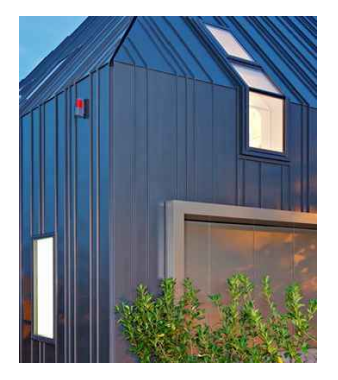
Metal faced vertical standing seam cladding Rheinzink - Private Residence