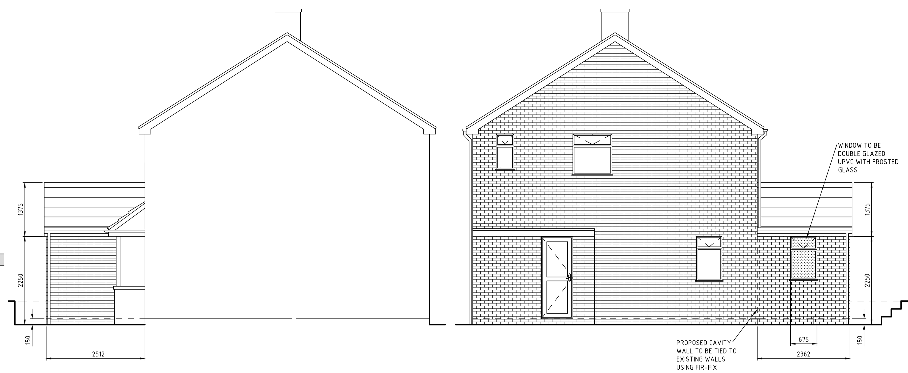
PROPOSED SIDE ELEVATION (FROM No. 42) 1 : 50

NOTE:- ALL DIMENSIONS ARE TO BE CHECKED ON SITE BY THE CONTRACTOR PRIOR TO CONSTRUCTION