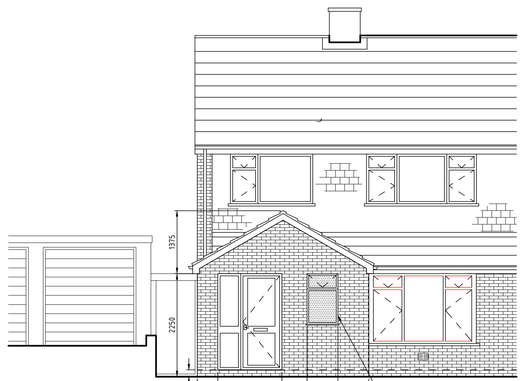
EXISTING FRONT ELEVATION 1 : 50