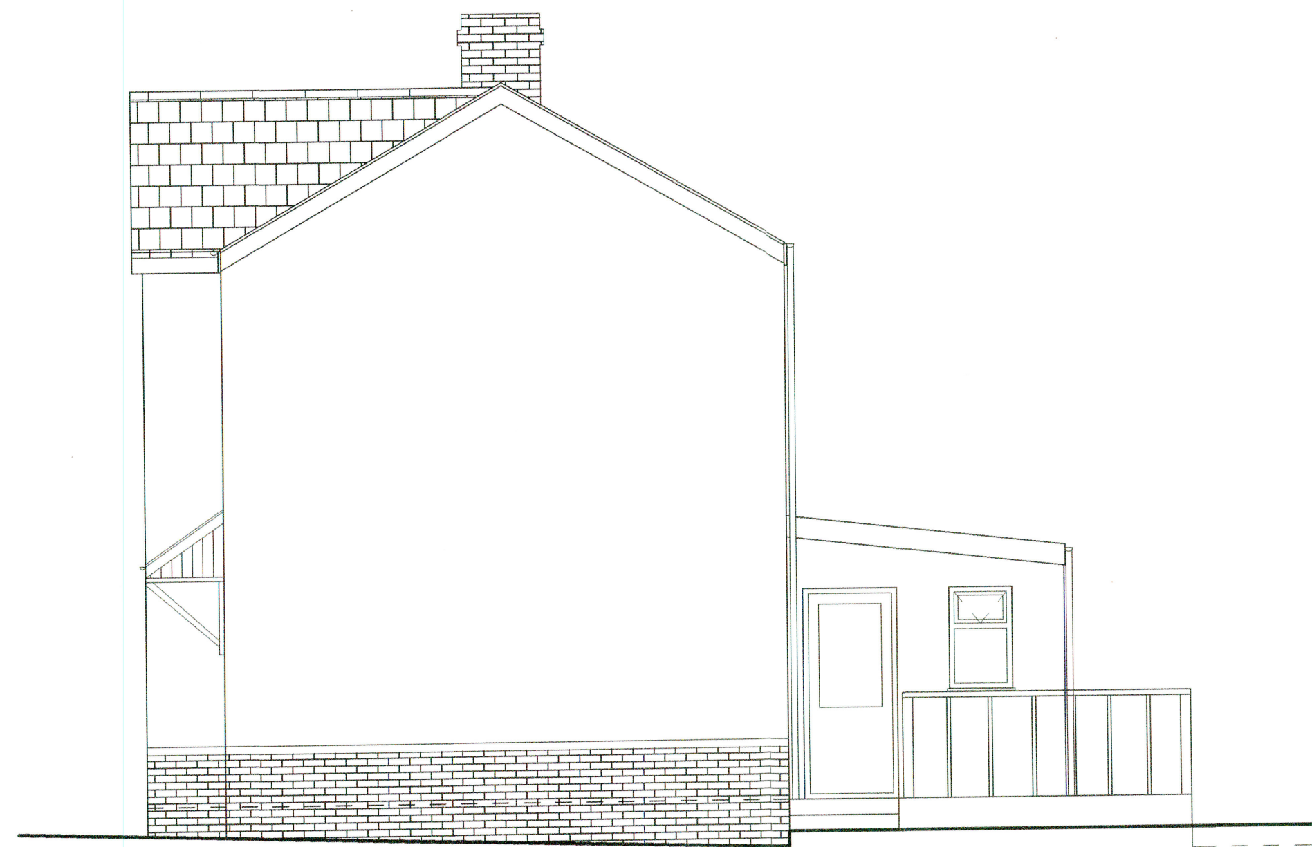
EXISTING SIDE ELEVATION (GARAGE OMITTED FOR CLARITY) 1:50