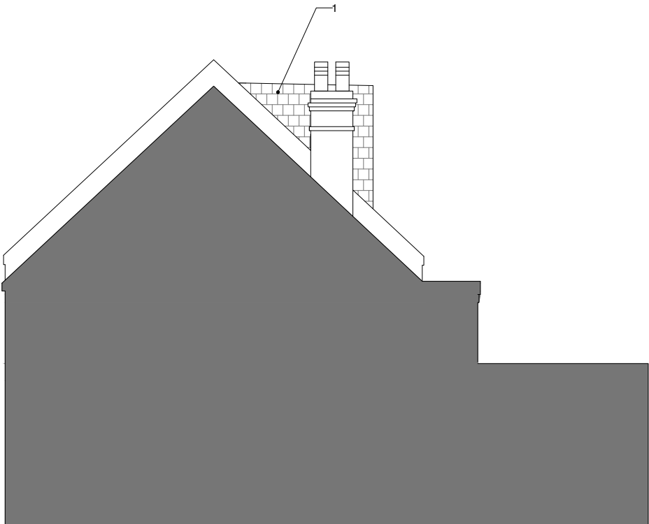
VIEW FROM NO.4 AS PROPOSED