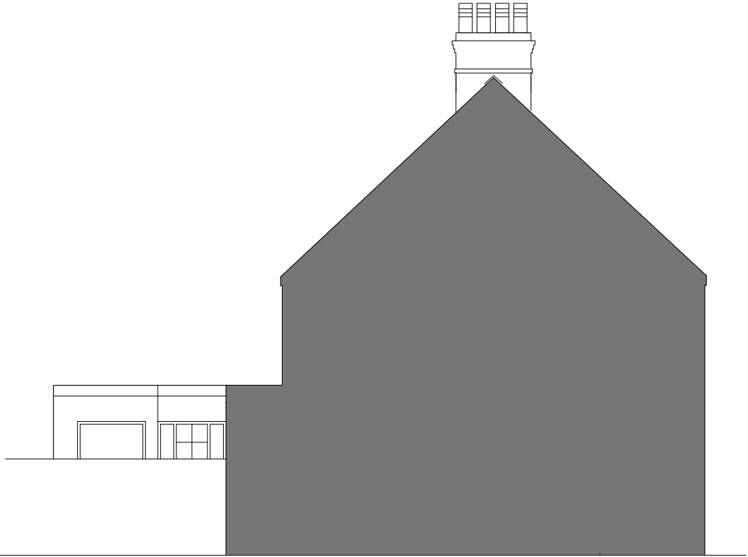
VIEW FROM NO.8 AS EXISTING