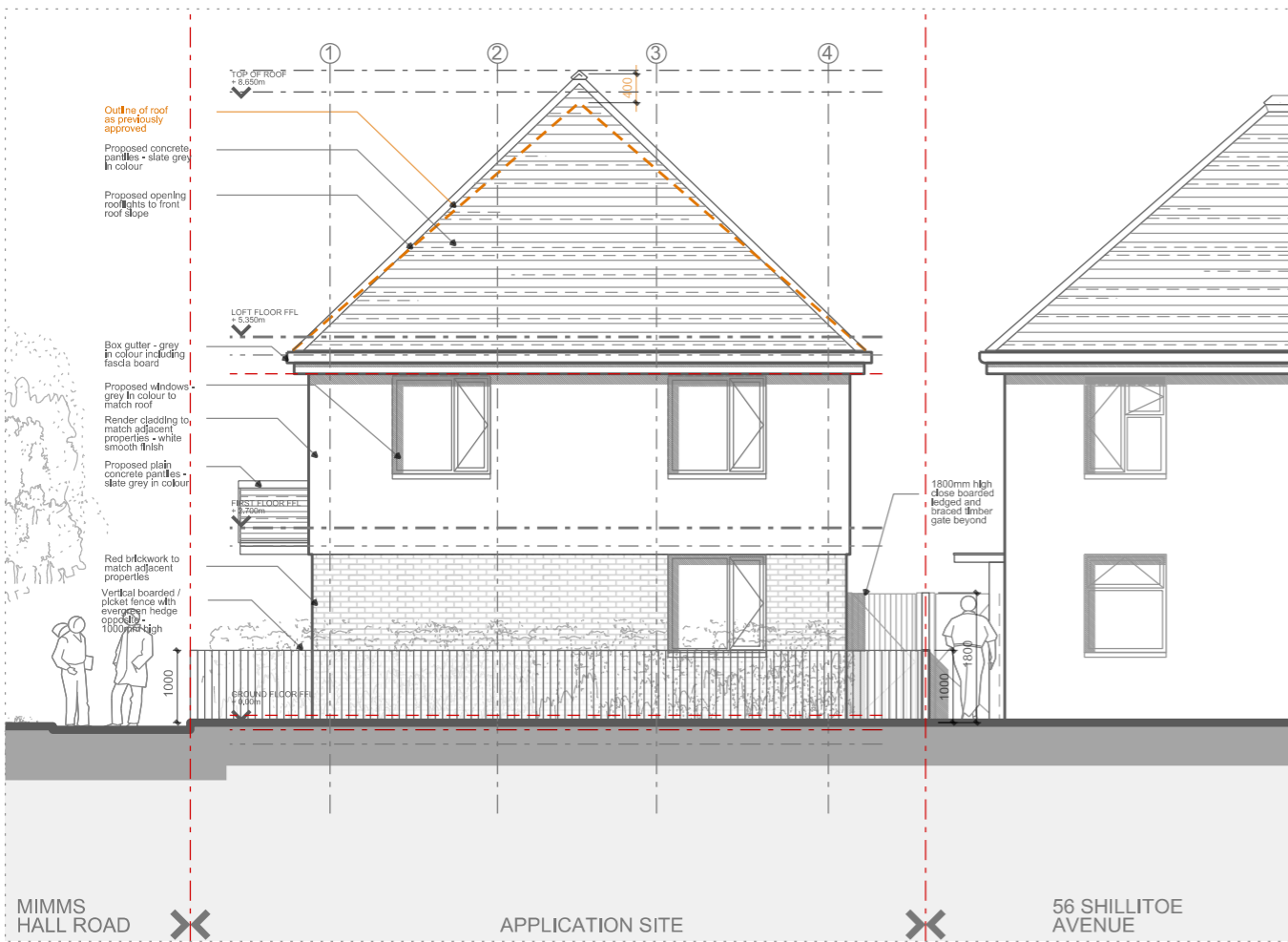
SOUTH ELEVATION - PROPOSED SCALE 1:100 @ A3