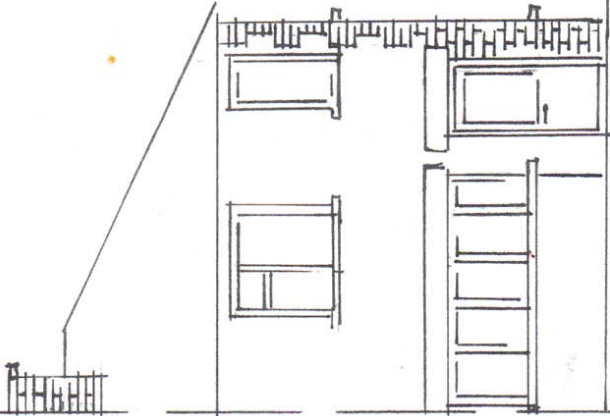
FRONT ELEVATION - EXISTING