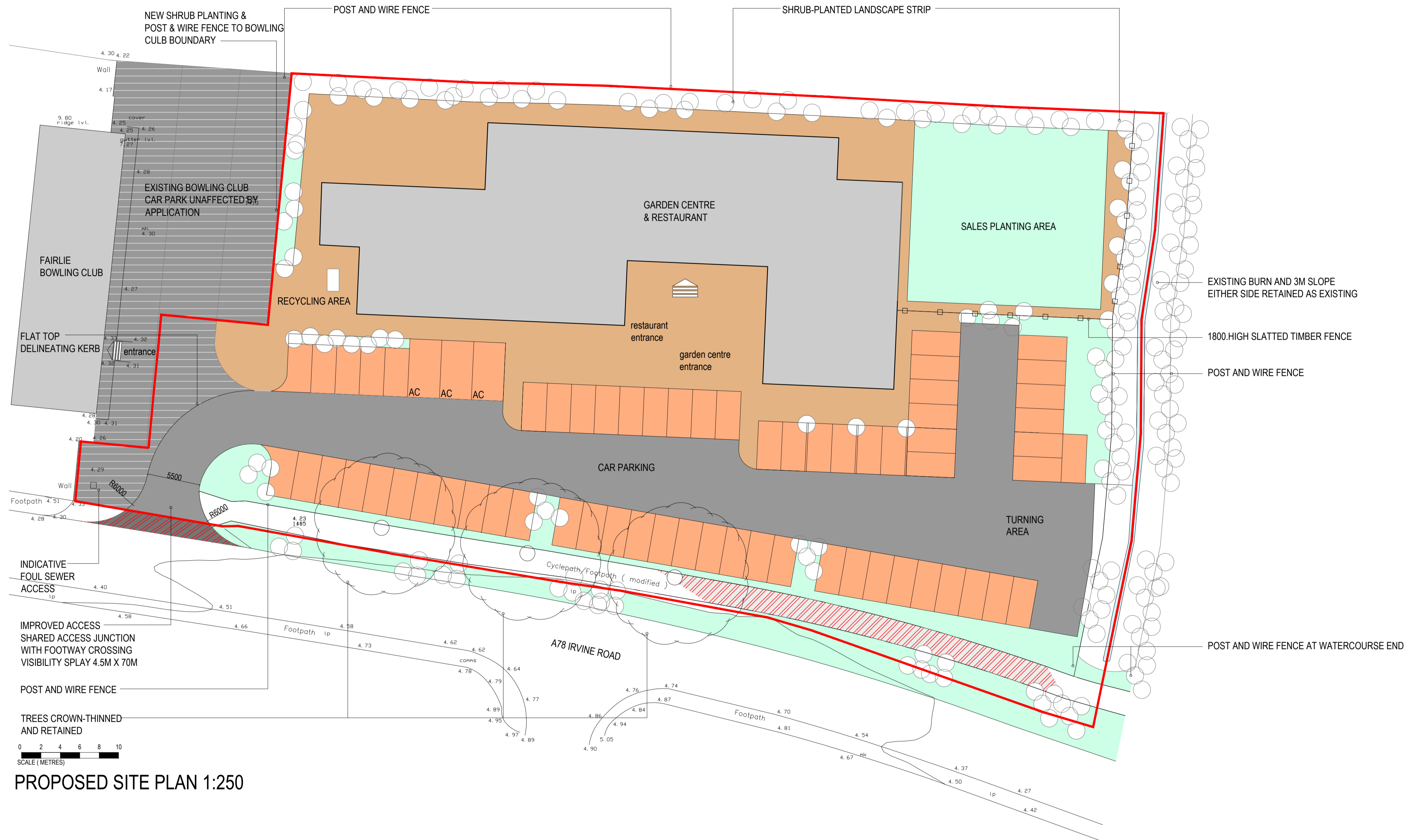
PROPOSED SITE PLAN 1:250