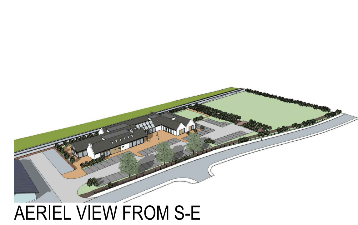
AERIAL VIEW FROM S-E

0 1 2 3 4 5 SCALE (METRES) ELEVATIONS 1:100