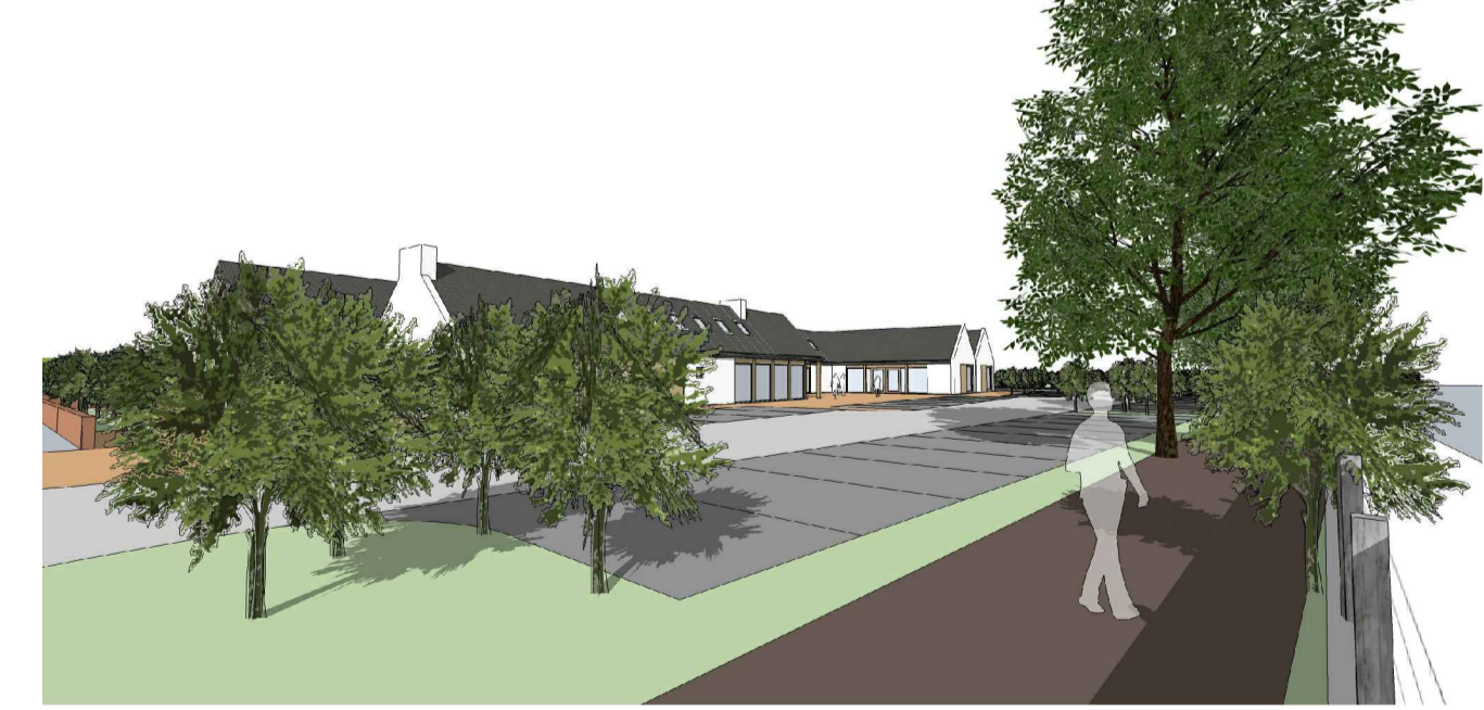
STREET ASPECT FROM S-E