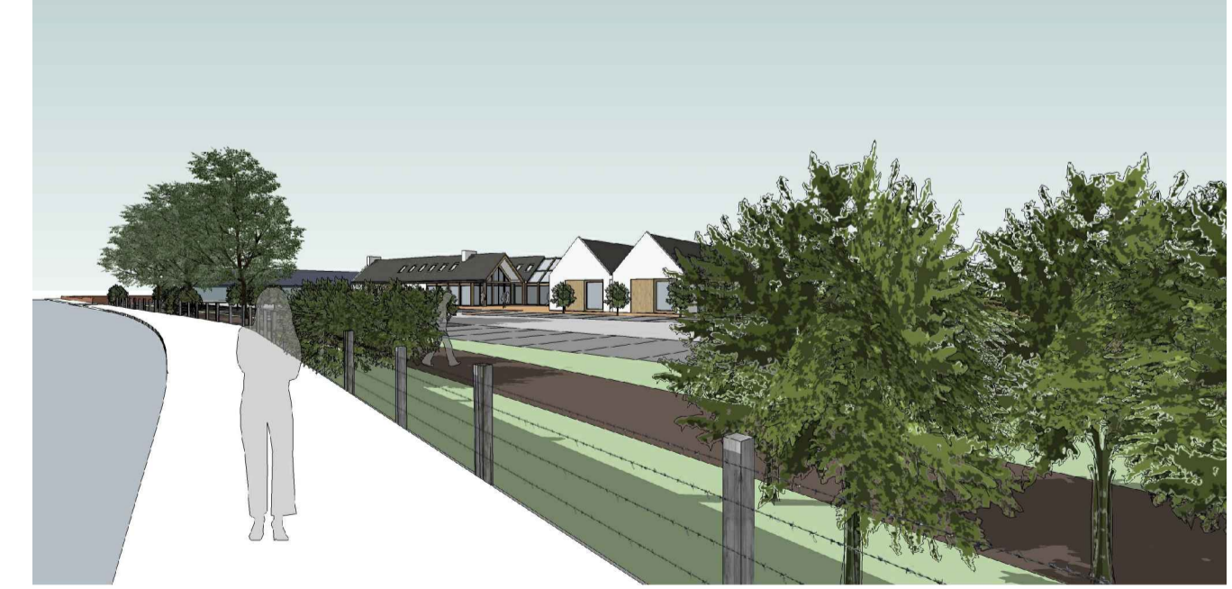
STREET ASPECT FROM N-E