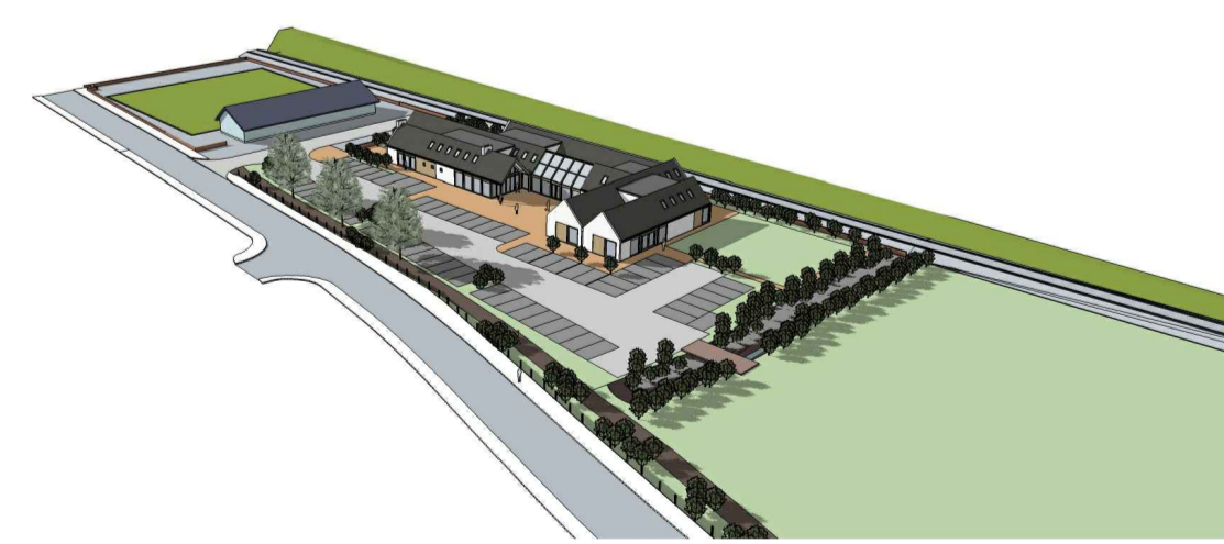
AERIAL VIEW FROM N-E

NOTE: READ IN CONJUNCTION WITH STEWART ASSOCIATES DRAWINGS NOS 1934 / P01 to 1934 / P07 INCLUDING DESIGN STATEMENT DOCUMENT NO. 1934 / P06.