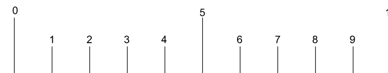
SCALE - METERS