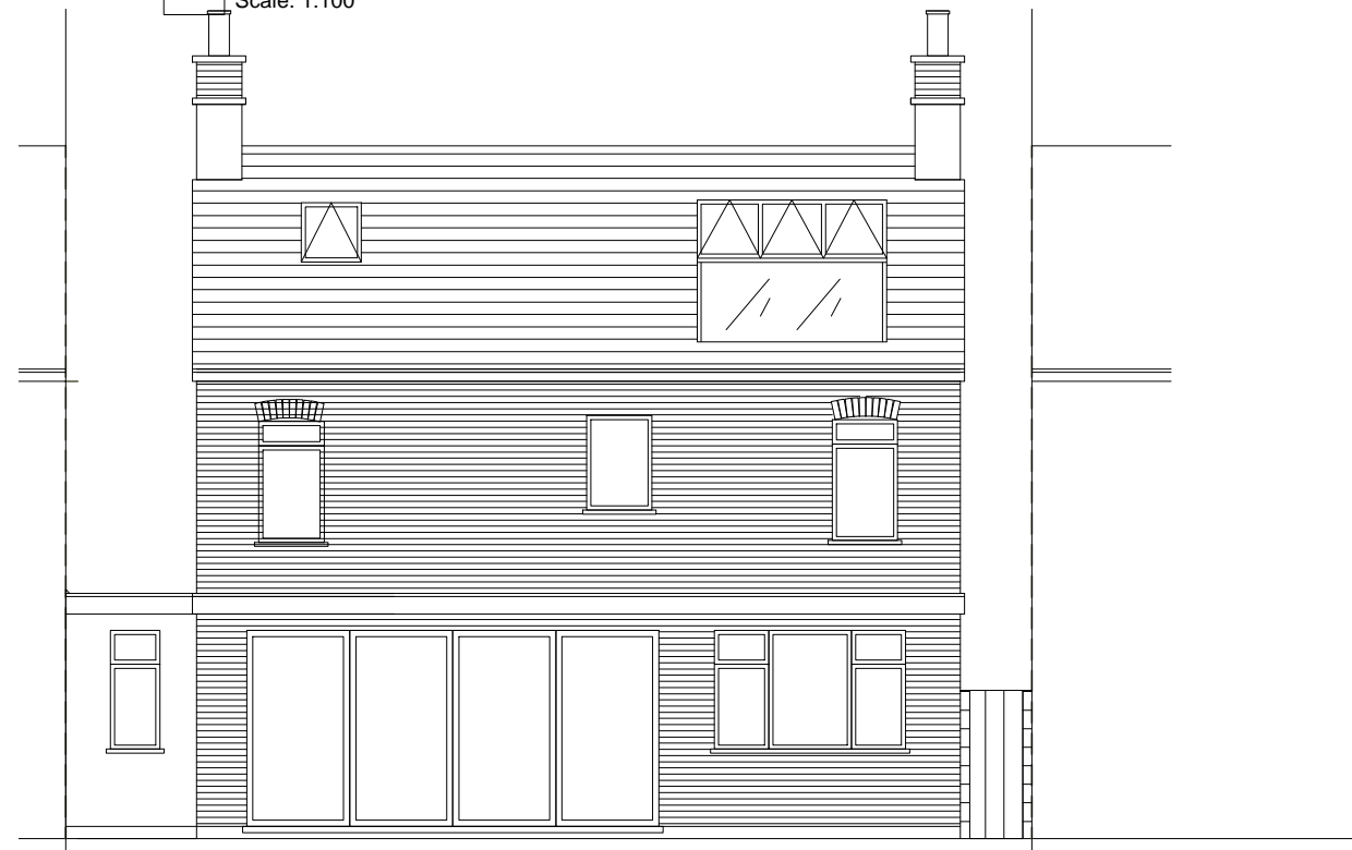
4 REAR ELEVATION - PROPOSED Scale: 1:100