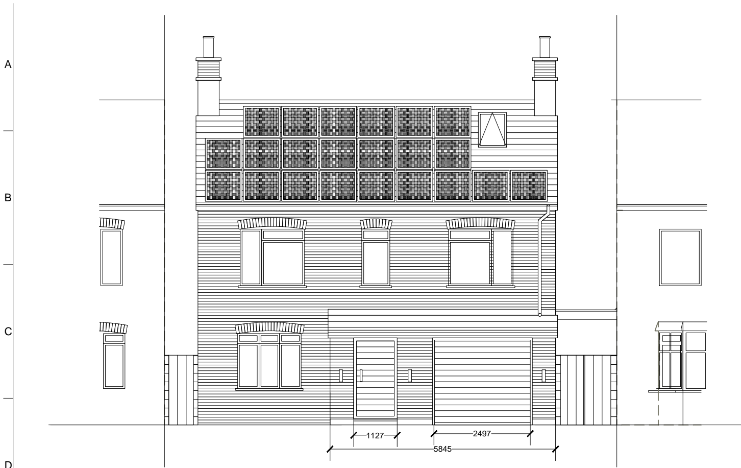
1 FRONT ELEVATION - PROPOSED Scale: 1:100