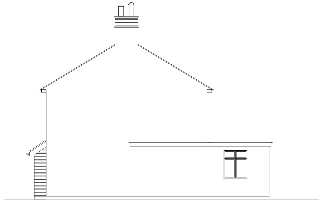
2 SIDE ELEVATION - PROPOSED Scale: 1:100