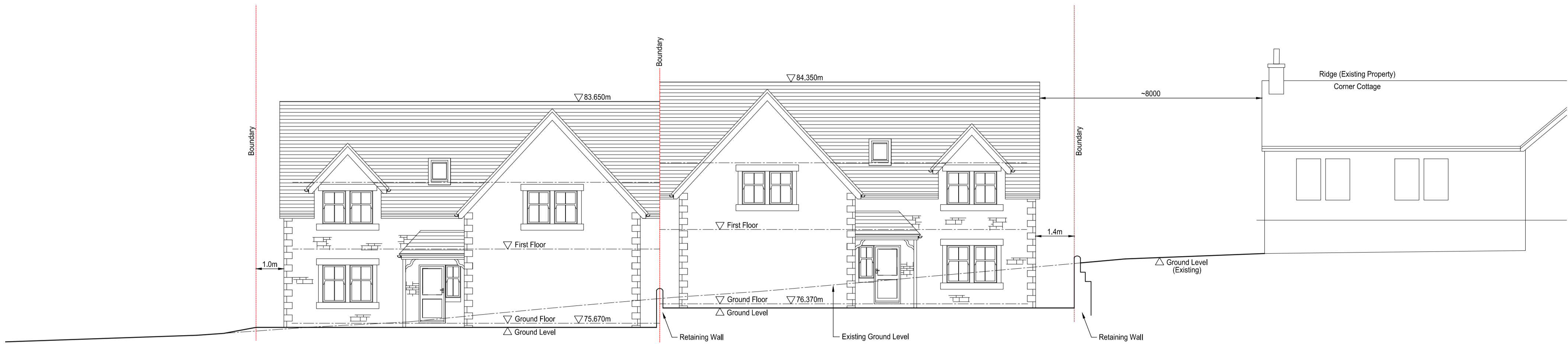
Section A-A Scale 1:100