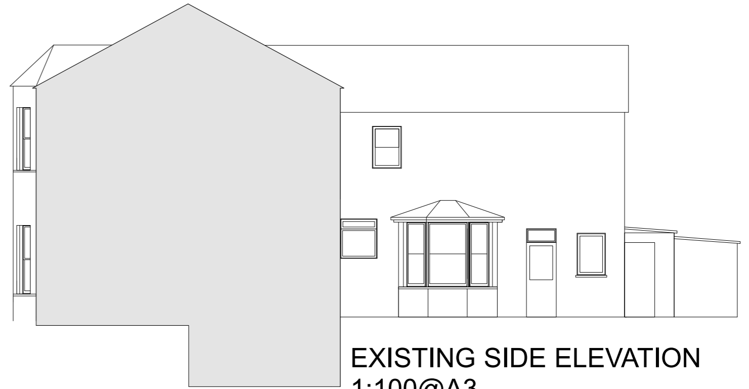
EXISTING SIDE ELEVATION 1:100@A3