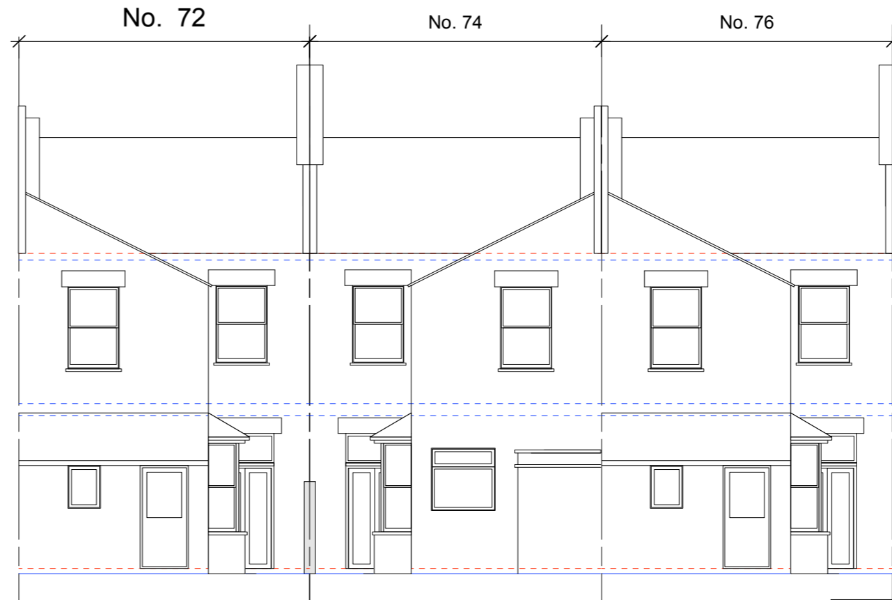
EXISTING REAR ELEVATION SHOWING NEIGHBOURS 1:100@A3