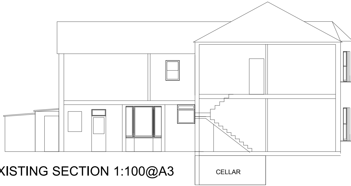
EXISTING SECTION 1:100@A3