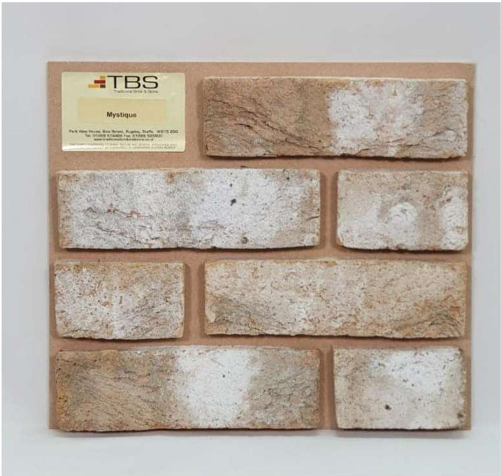
Proposed Brick Traditional Brick and Stone Mystique