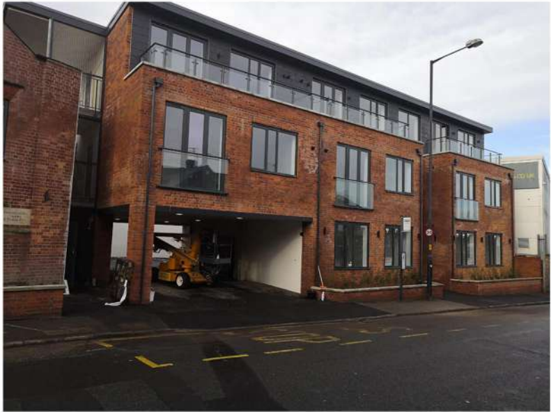
Example of eternit slates being used as wall cladding on previously completed scheme in Bristol by the developer