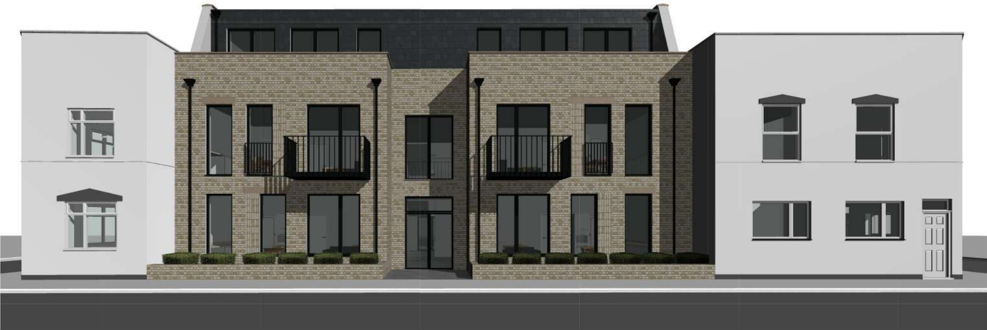
Proposed South Elevation showing Mystique brickwork with vertical hung tiles to set back upper floor. Windows and doors will all be black to match the slates.