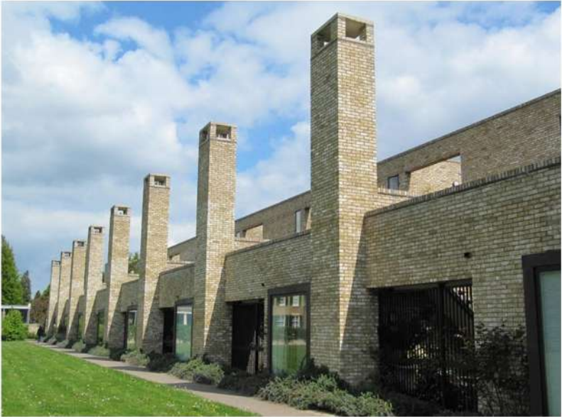
Example projects utilising the TBS - Mystique brick