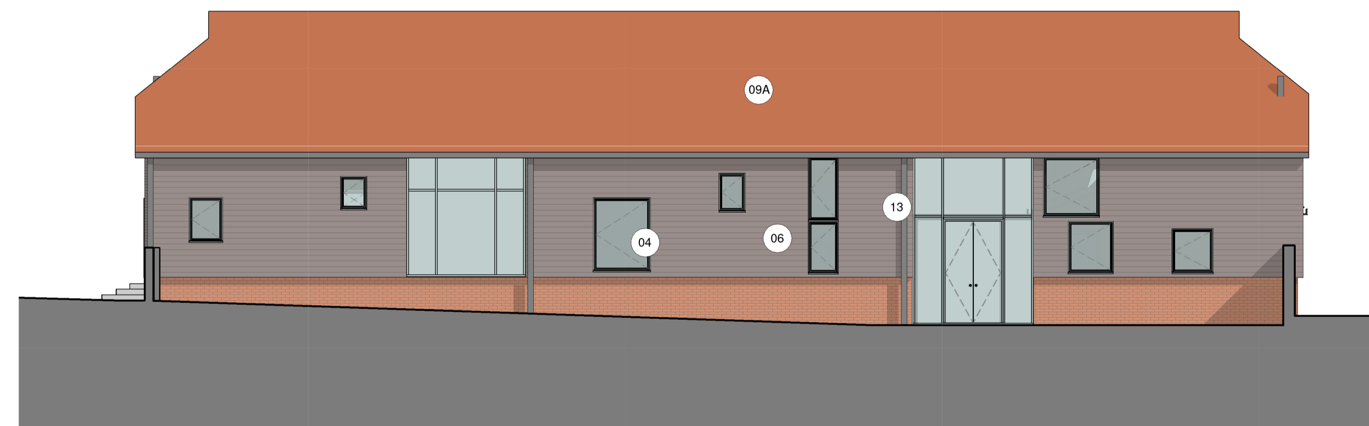
2 PROPOSED EAST ELEVATION - GRANARY 1 : 100 Elevation