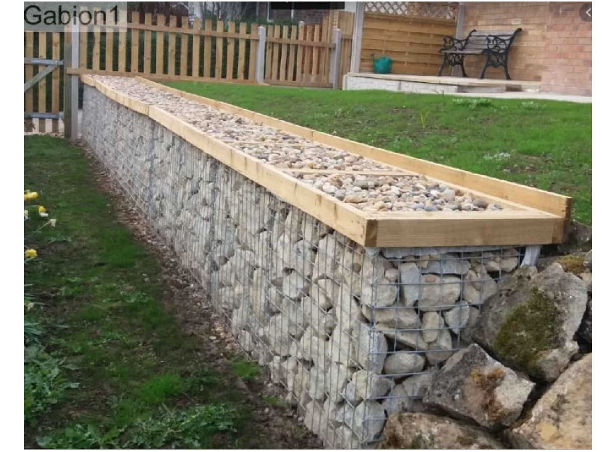
GABION BASKET SYSTEM