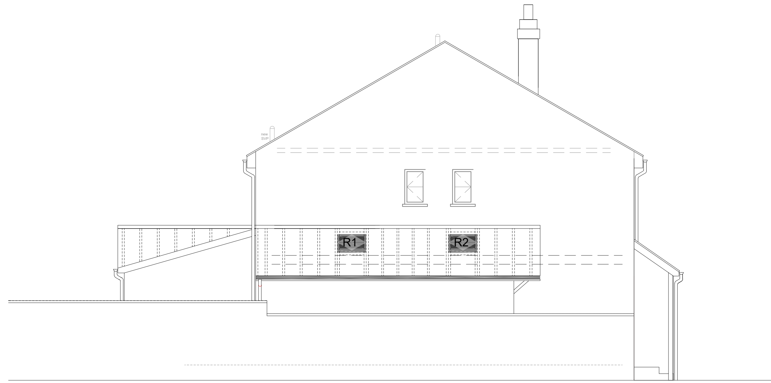
PROPOSED SOUTH (SIDE) ELEVATION - UNCHANGED