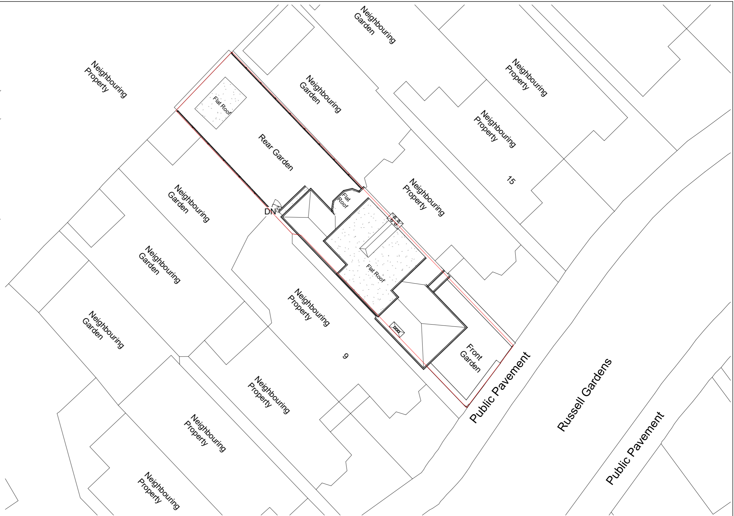
1 Location Map 1 : 200