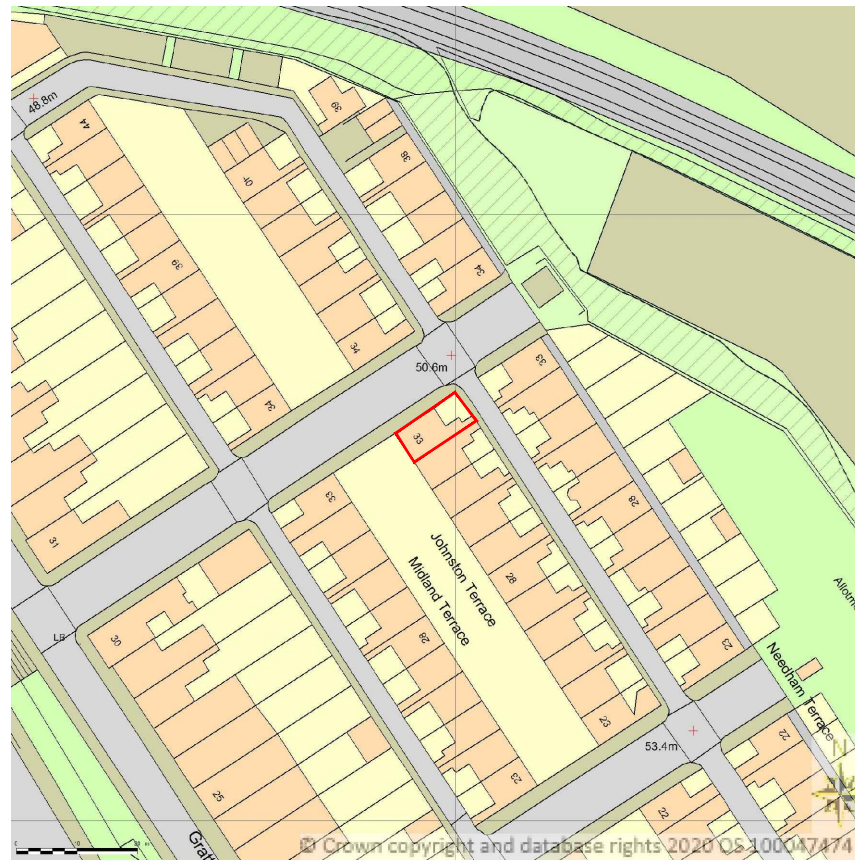
LOCATION PLAN Sc. 1/1250