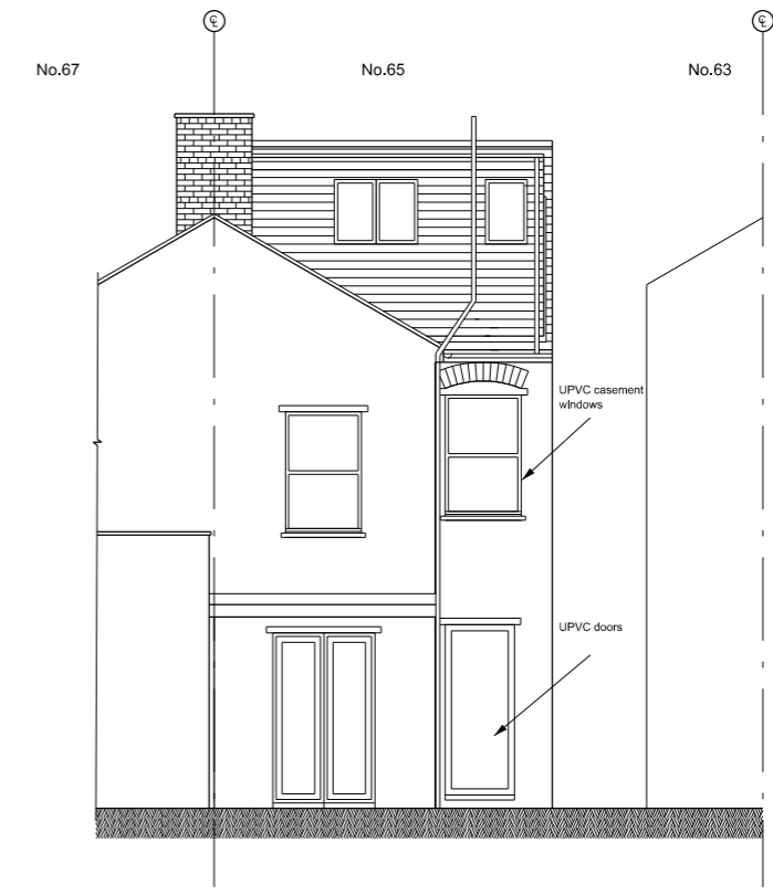
Existing Rear Elevations (1:100)