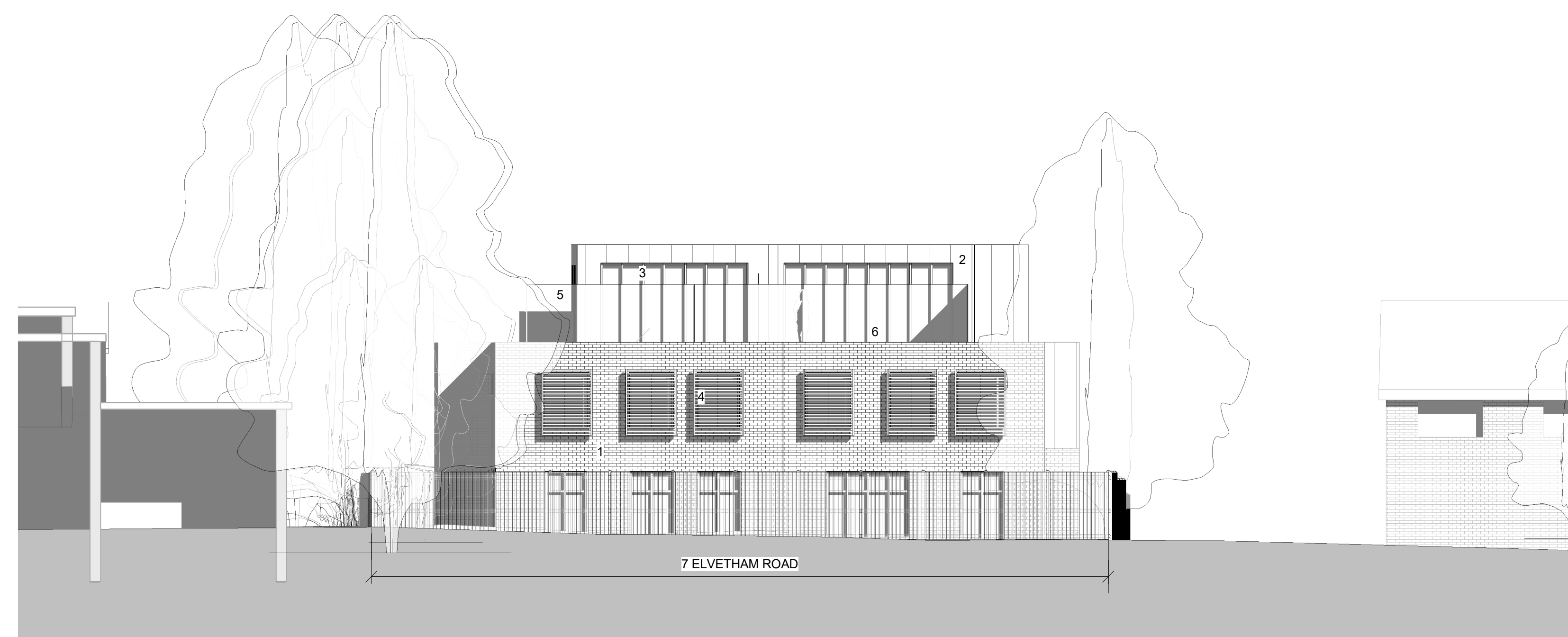
2 Proposed - South 1 : 100