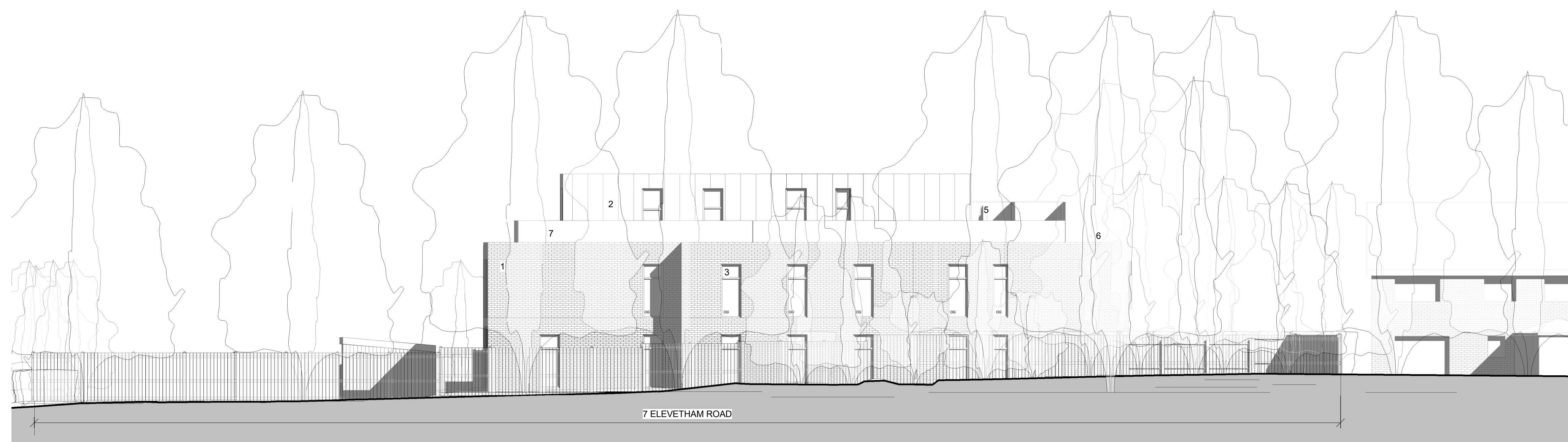
3 Proposed - West 1 : 100