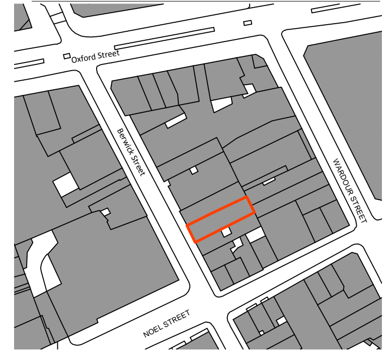
Site Location Plan 1:1250

Note This drawing is protected by copyright and must not be copied or reproduced without the written consent of Graham Simpkin Planning. All dimensions and sizes to be checked on site. North points are indicative. ©