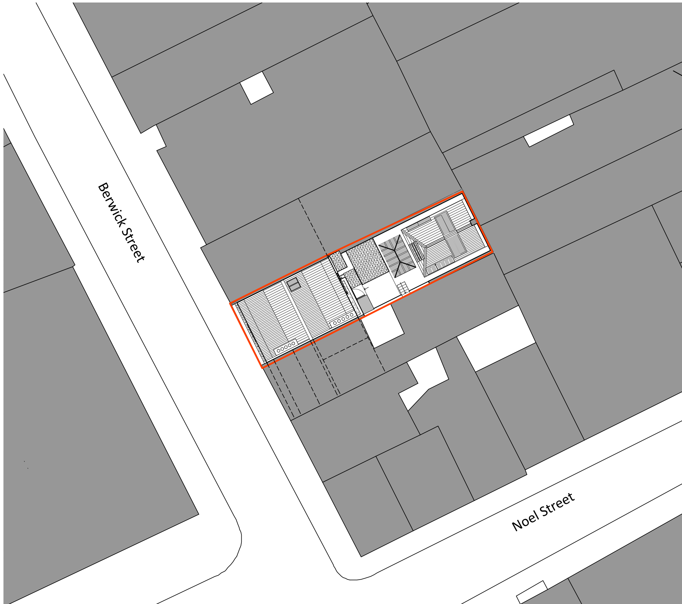
Block Plan 1:200