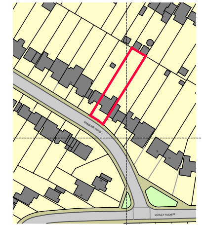
Location Plan Scale 1:2500

This drawing should not be scaled from and written dimensions must only be taken from this drawing. All dimensions must be checked on site and any discrepancies must be reported to the architect / contract administration before proceeding.