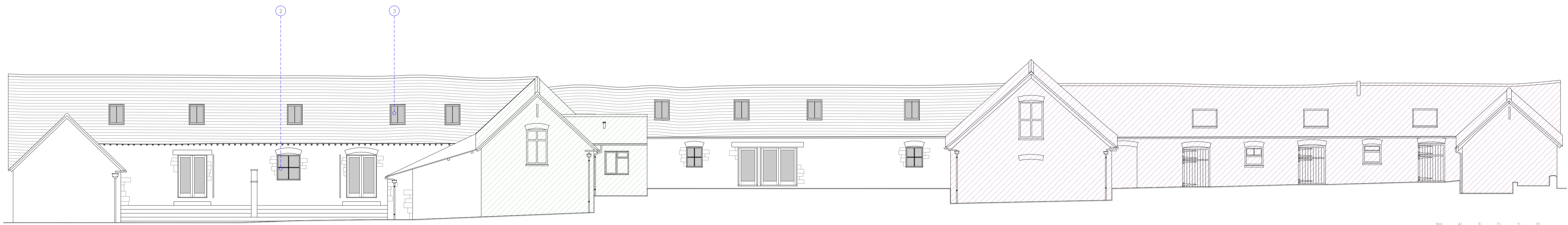
East Elevation 1:100