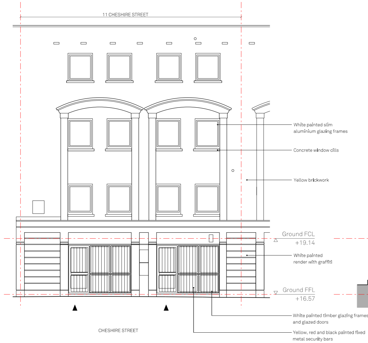
01 ELEVATION - EXISTING FRONT SCALE 1:100