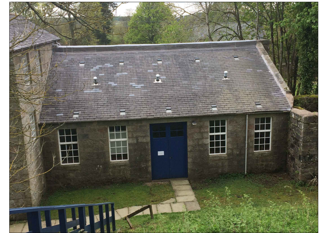
North Elevation After Undertaking Works