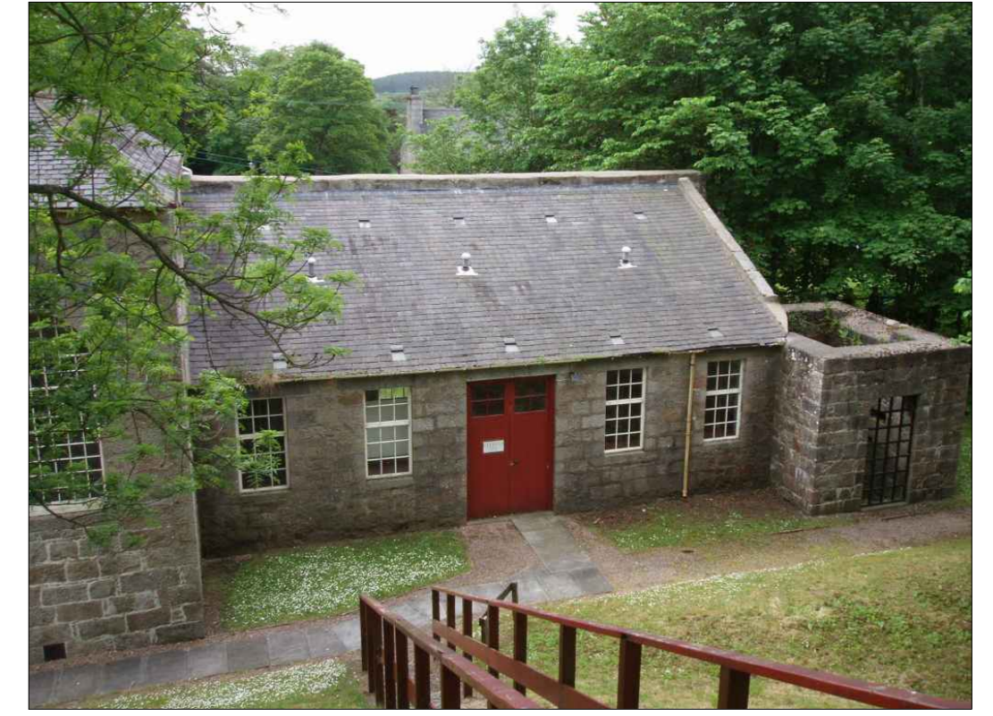
North Elevation Before Undertaking Works (Historic Image)