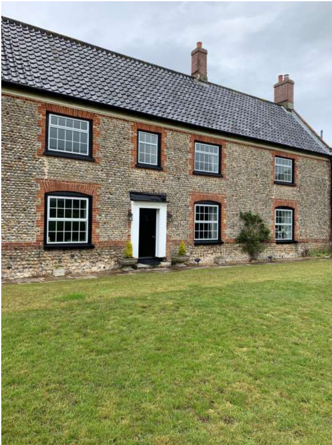
View of the building from the south, windows can be viewed from Mundesley Road.