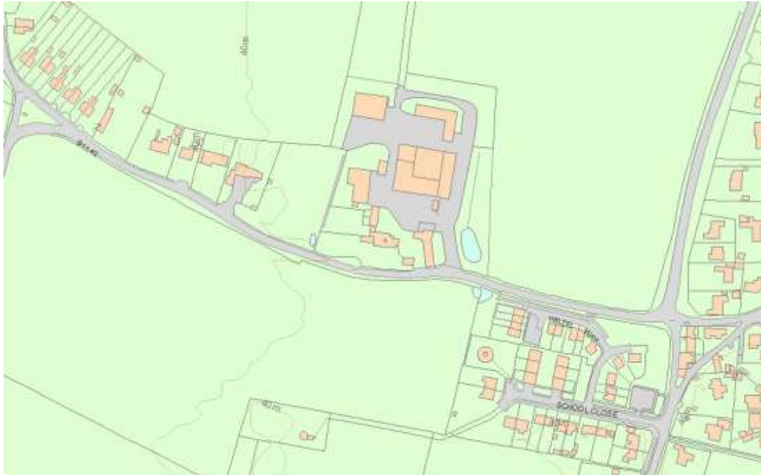
Location of the farm house

Archive image, may not represent current condition of site.