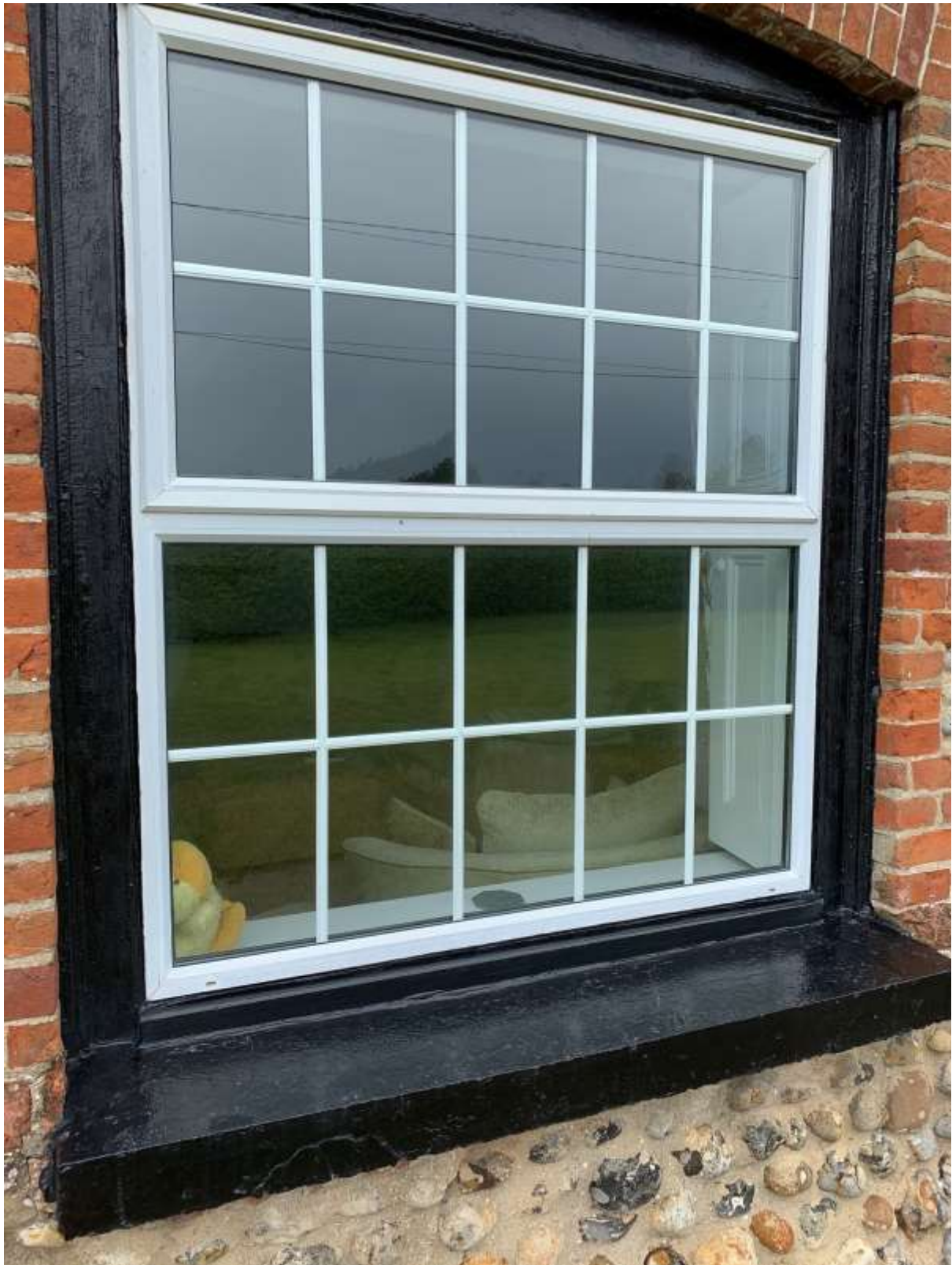
Close up external view of the lounge window