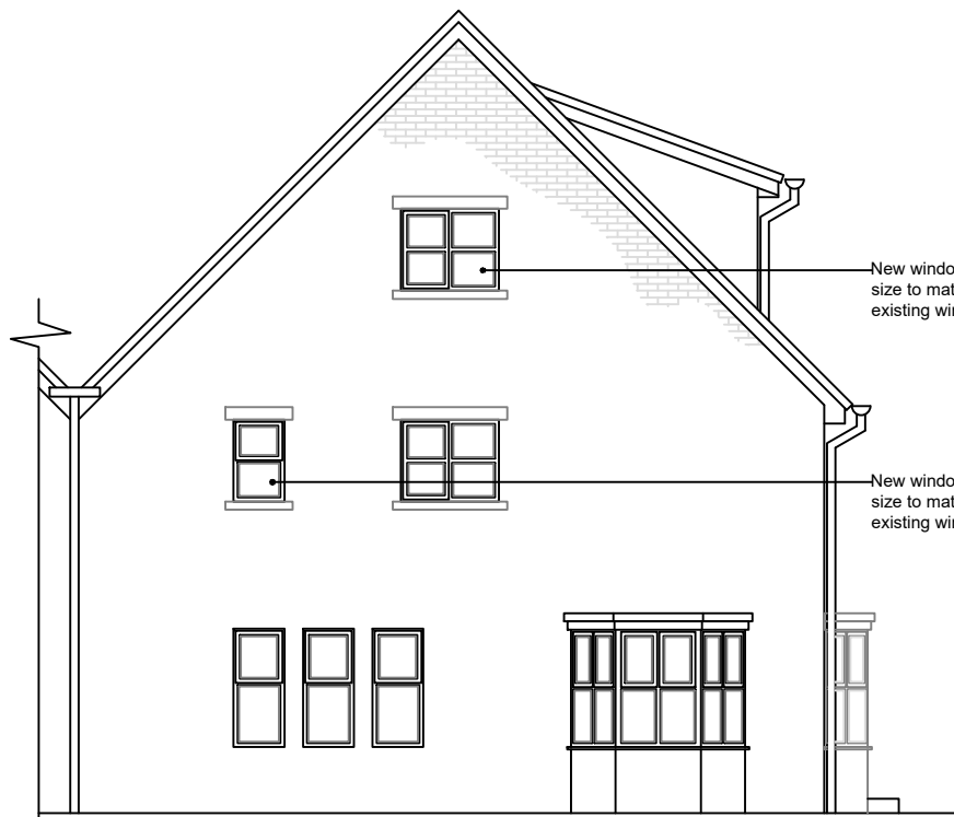
Proposed L/H Side Elevation 1:100