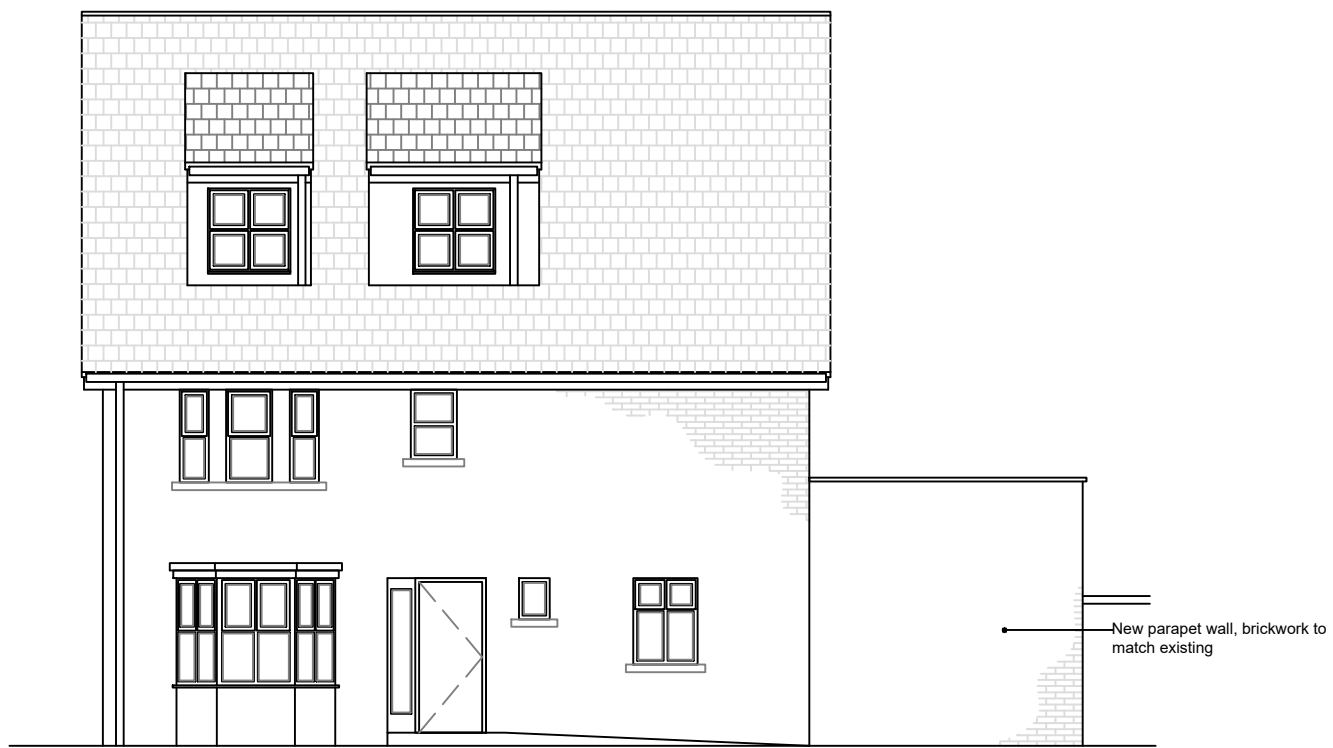
Proposed Front Elevation 1:100