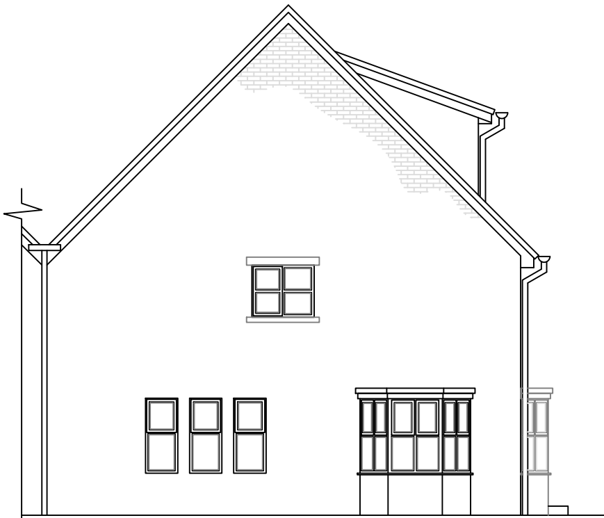
Existing L/H Side Elevation 1:100