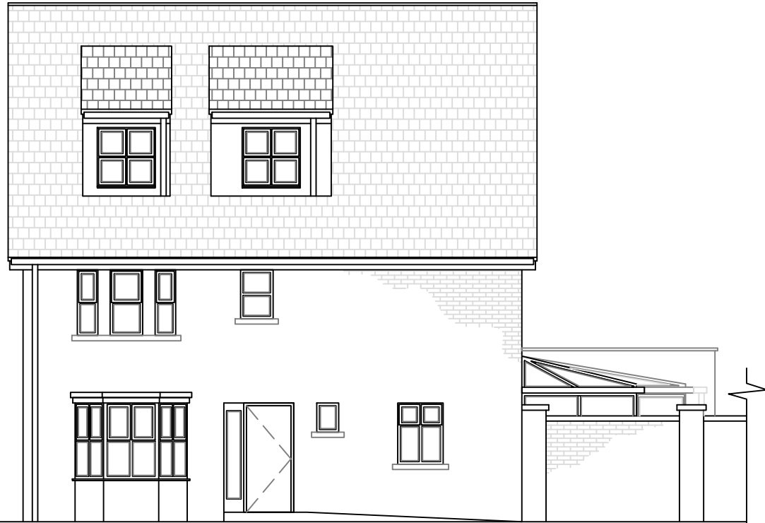
Existing Front Elevation A 1:100