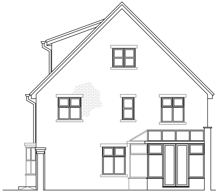
Existing R/H Side Elevation 1:100