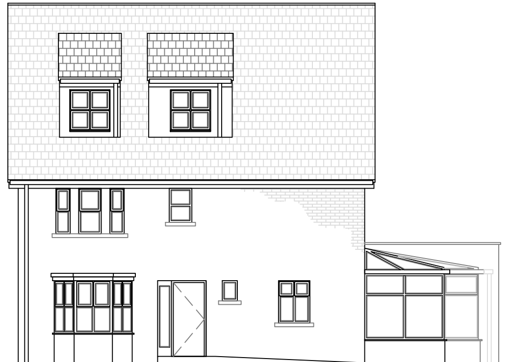
Existing Front Elevation B 1:100