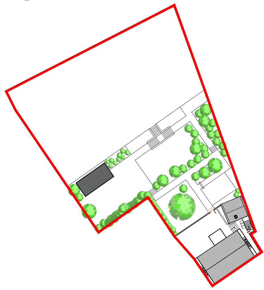
SITE PLAN: SCALE 1/500