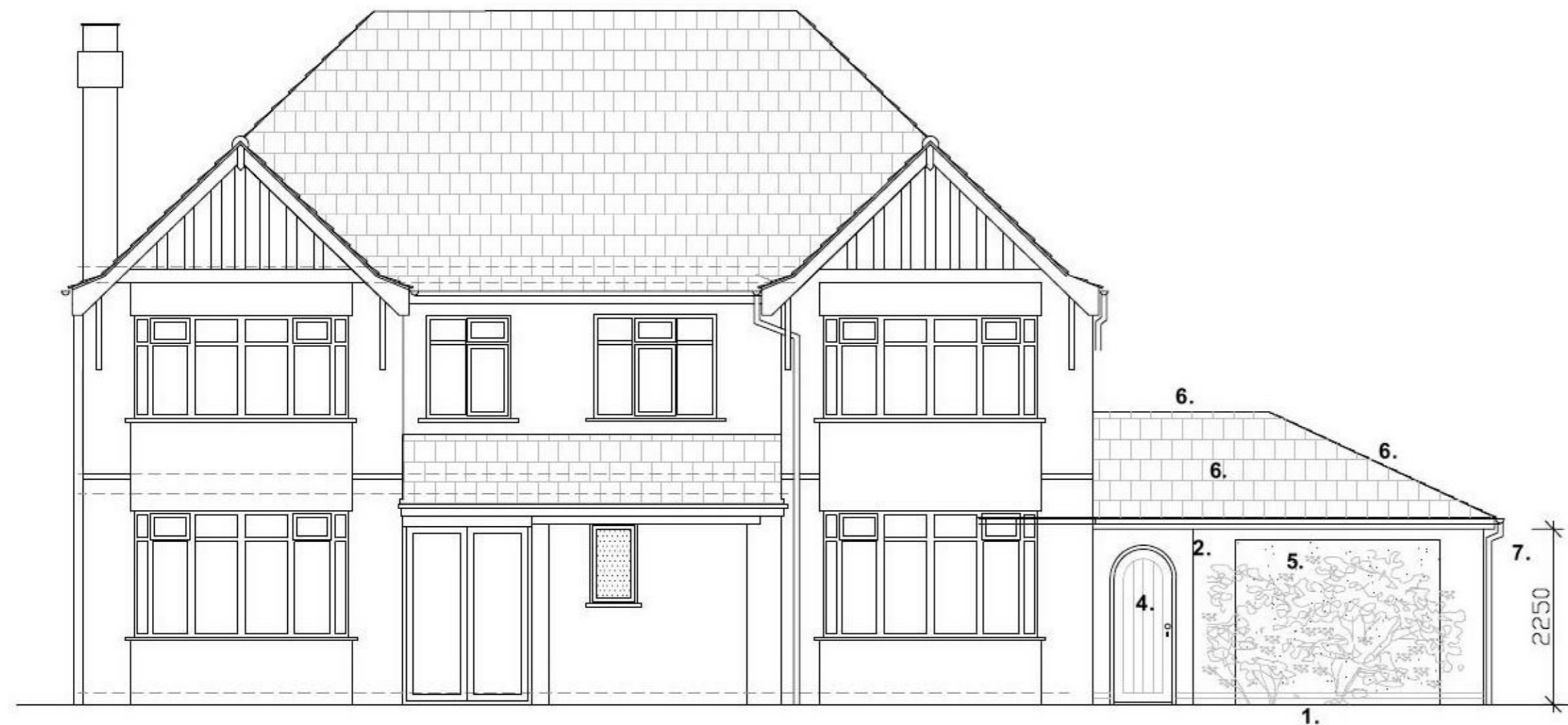
North (Front) Elevation Proposed Scale 1:100 @ A3