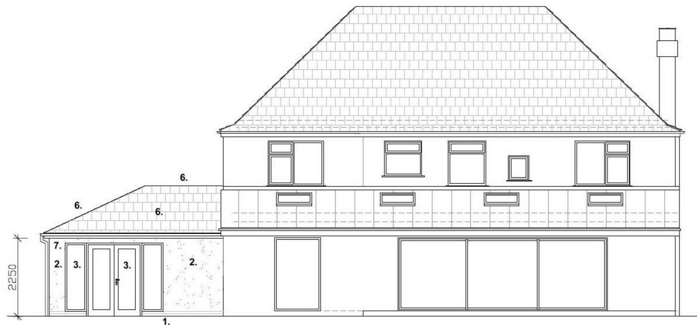
South (Rear) Elevation Proposed Scale 1:100 @ A3