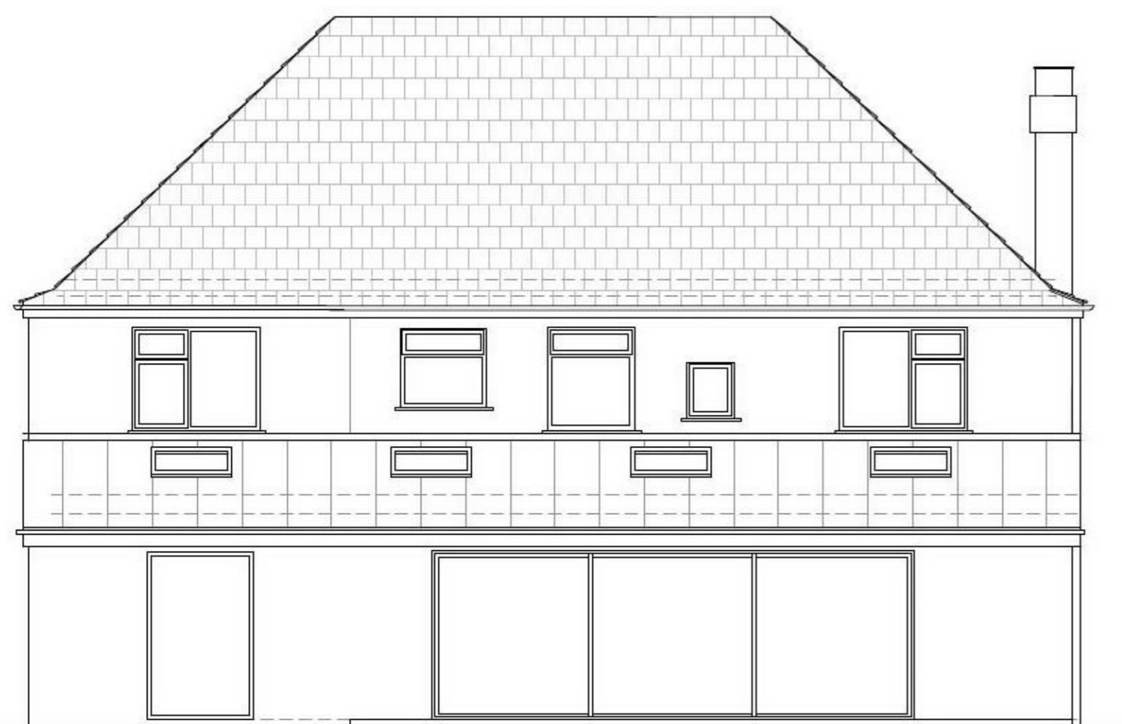
South (Rear) Elevation Existing Scale 1:100 @ A3