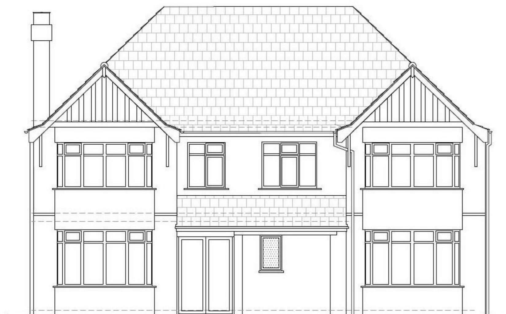
North (Front) Elevation Existing Scale 1:100 @ A3