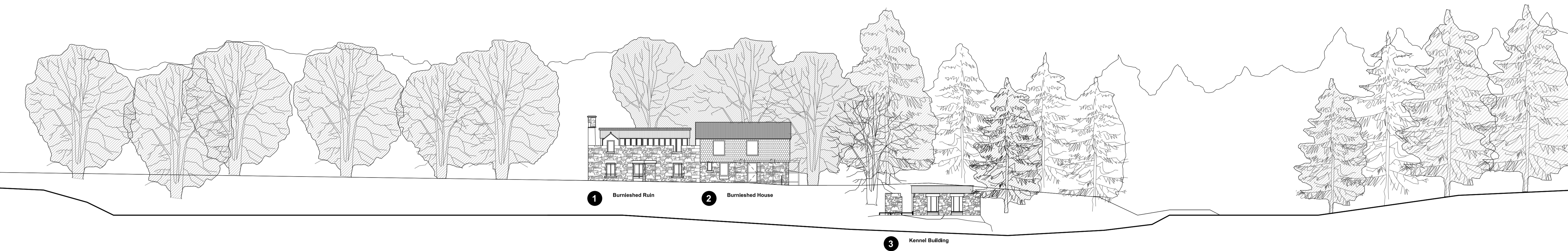
S1 Site Section - looking North