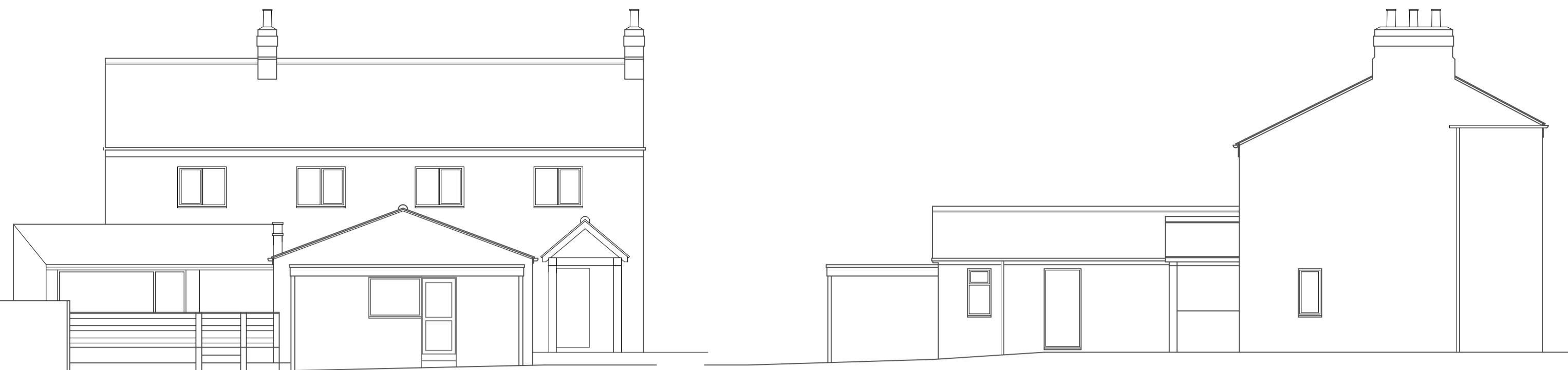
Existing Rear Elevation 1:100

All Dimensions Shall be Checked on Site by the Contractor Prior to Commencement of Work on Site. Do Not Scale. If in Doubt Ask.