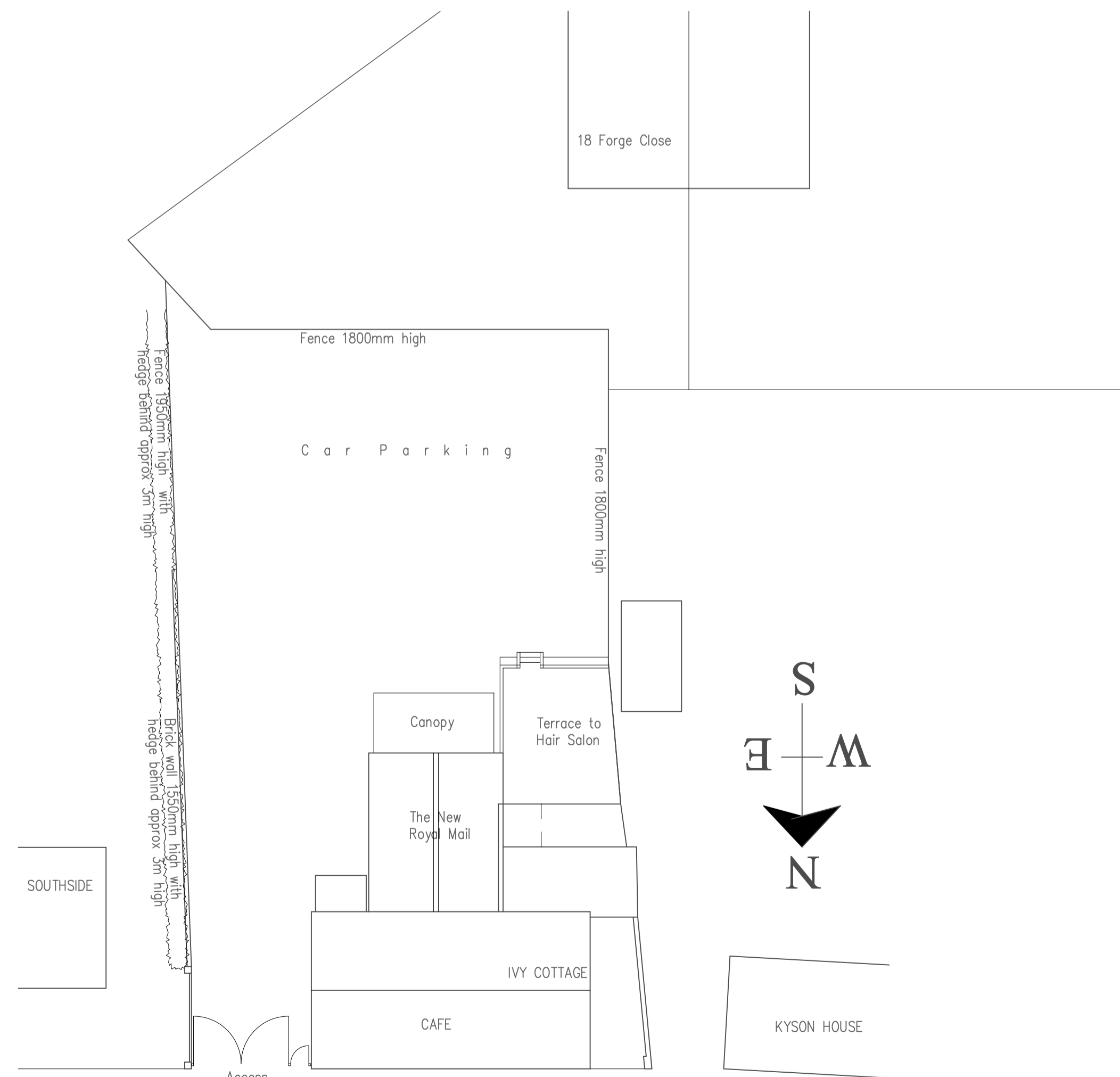
Existing Block Plan Scale 1:200