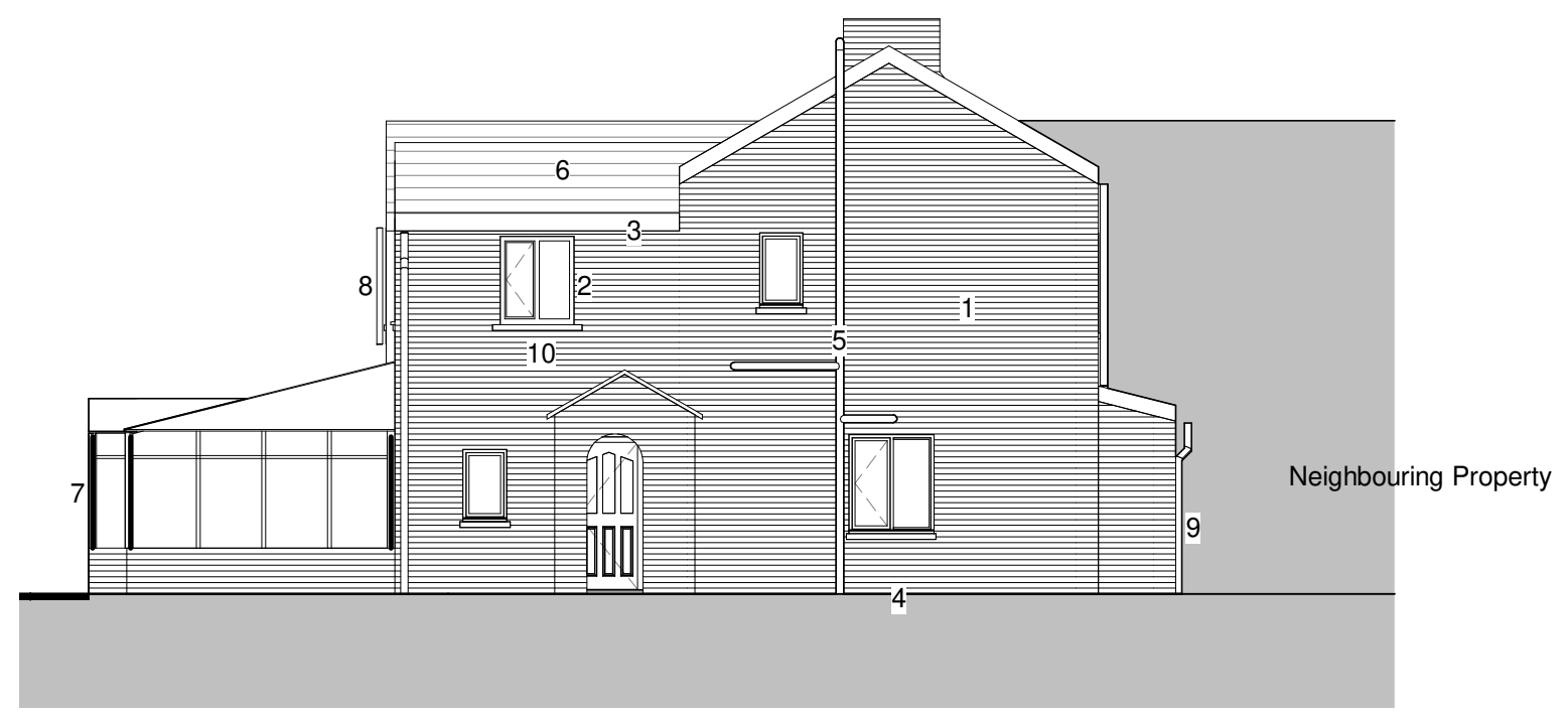
South West Elevation - As Existing 1 : 100