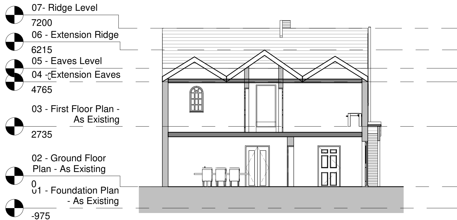
Section A-A - As Existing 1 : 100