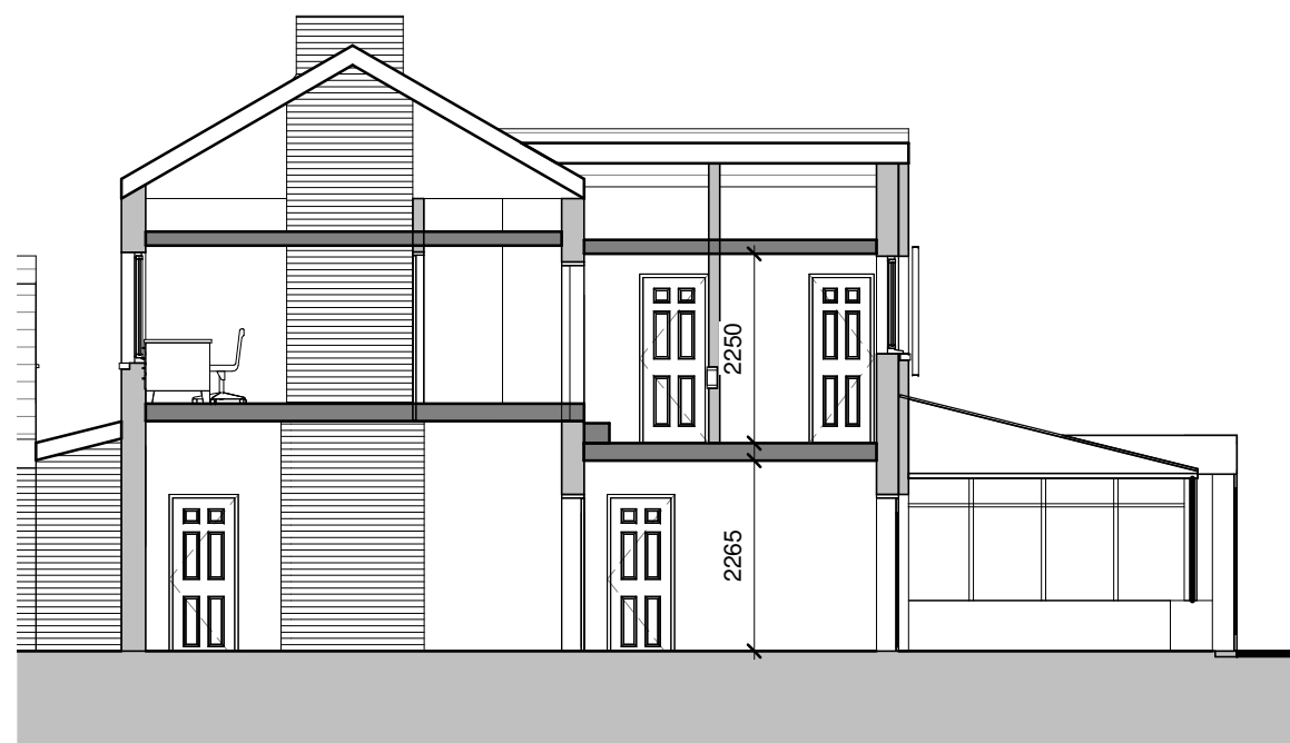
Section B-B - As Existing 1 : 100