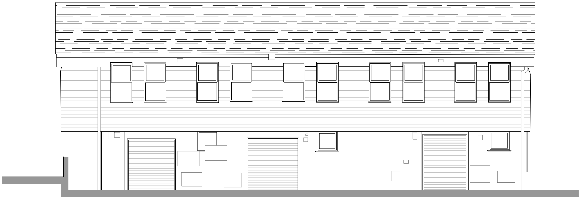
REAR (WEST) ELEVATION