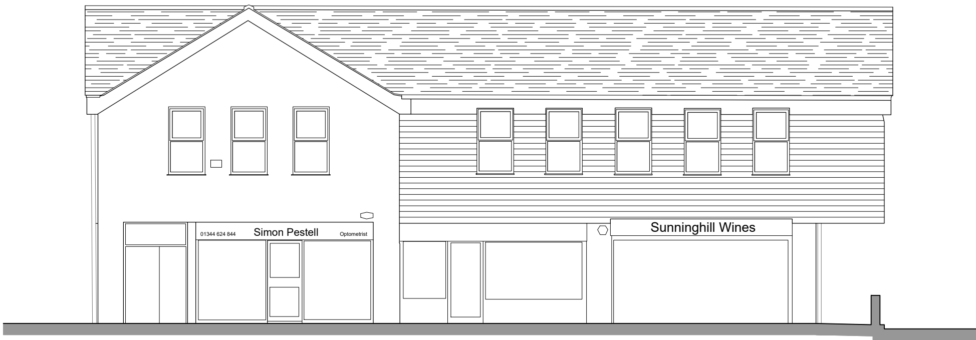
FRONT (EAST) ELEVATION