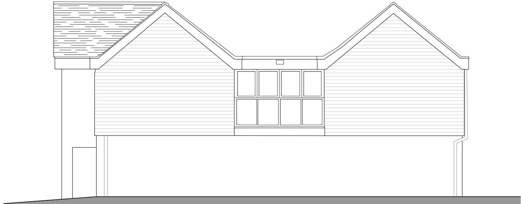
SIDE (NORTH) ELEVATION