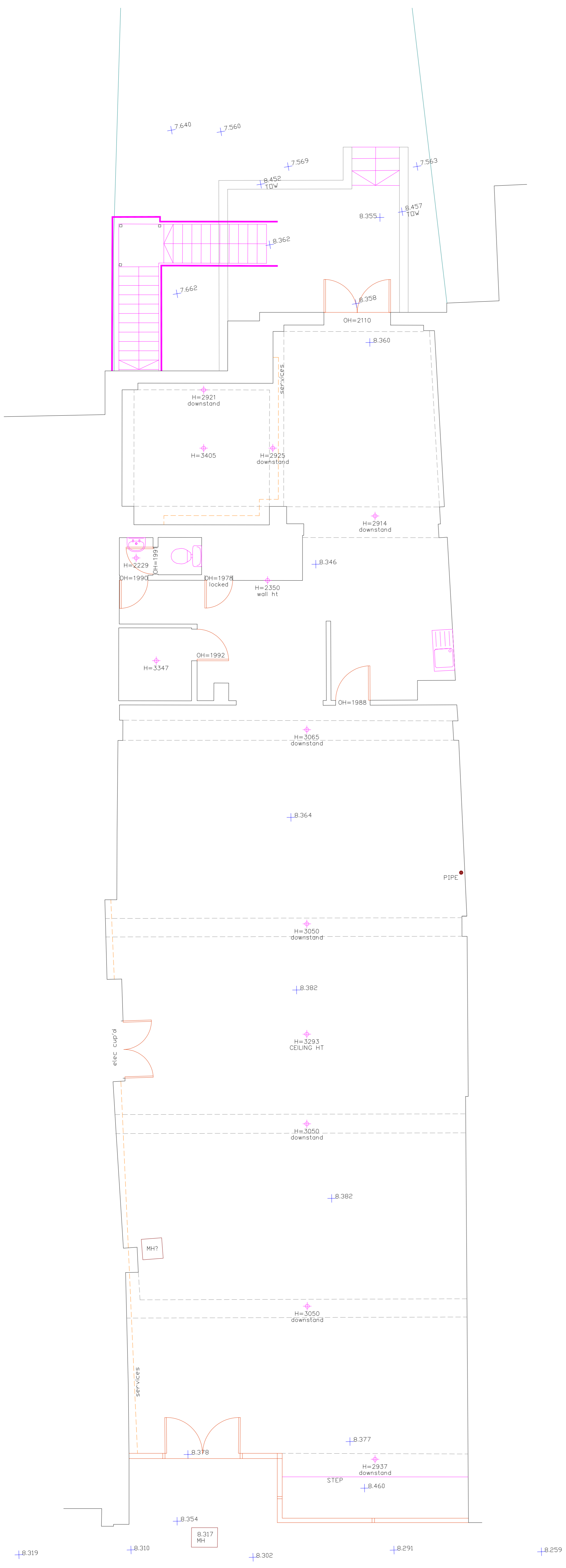
GROUND FLOOR PLAN 1:50