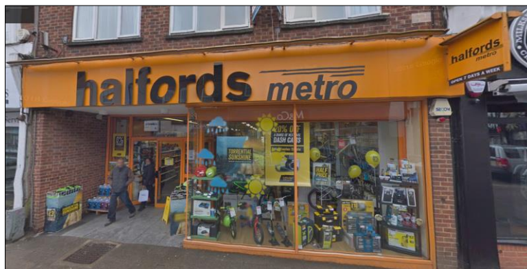
Previous view of the shopfront