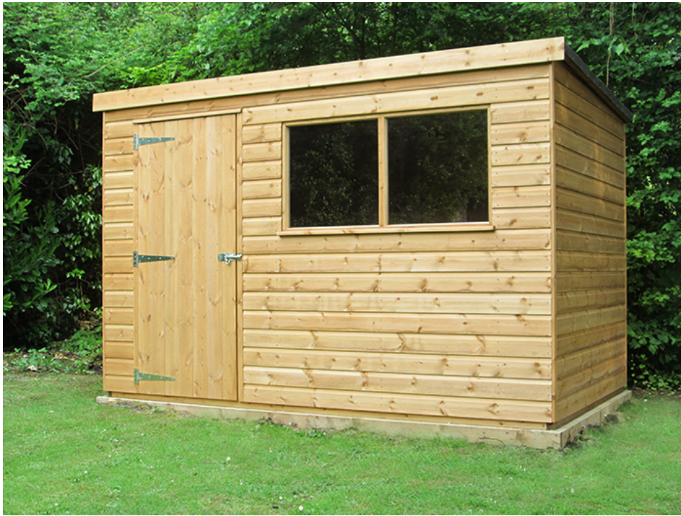
8 x 10Ft Pent Garden Shed