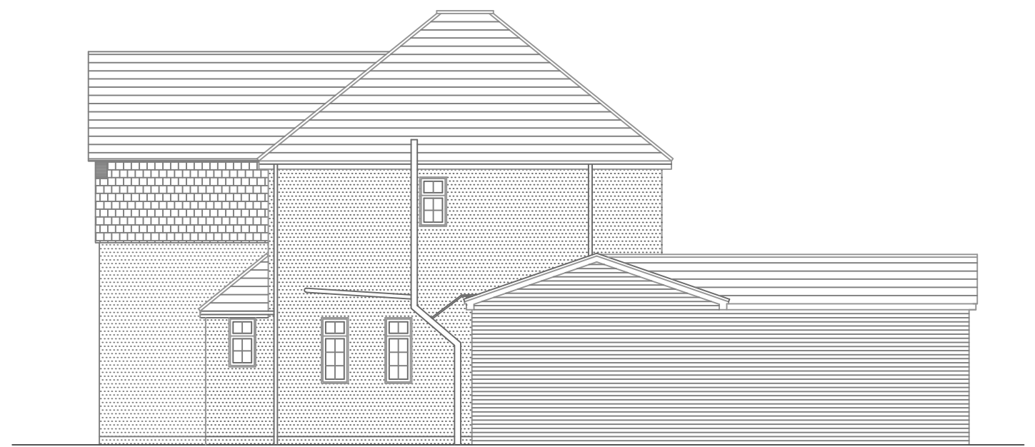
Existing Flank Elevation