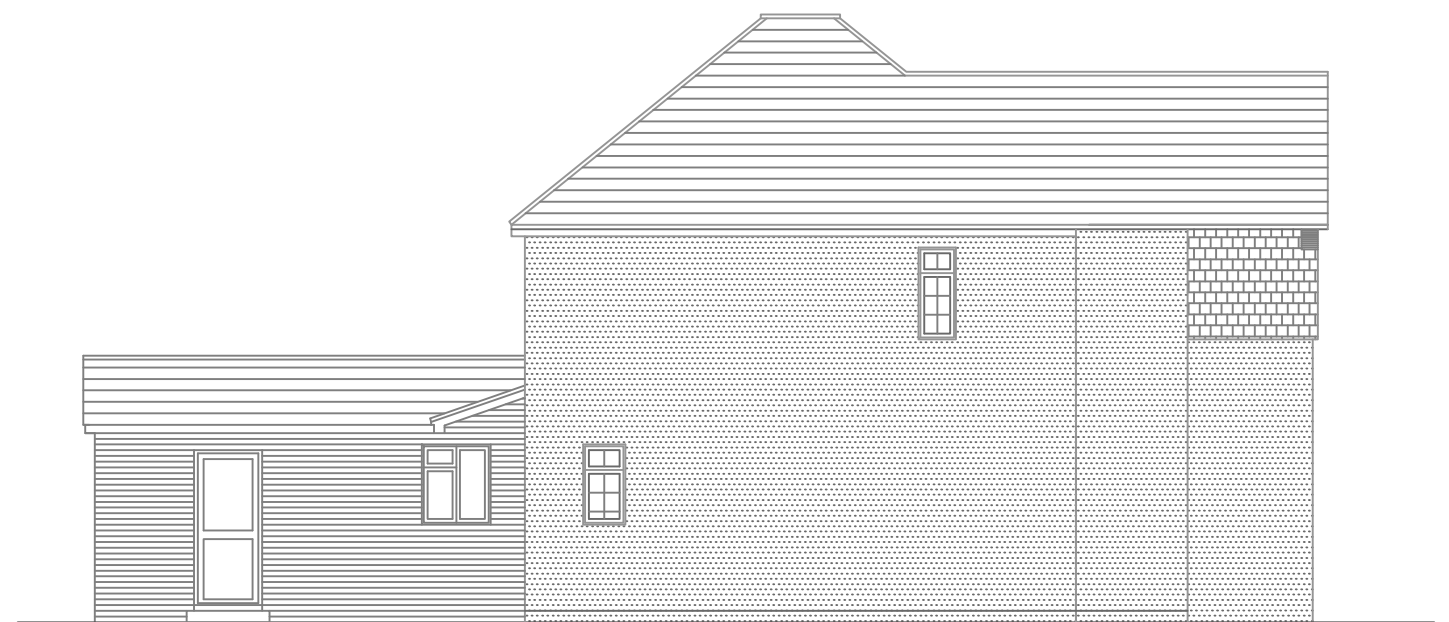
Existing Flank Elevation