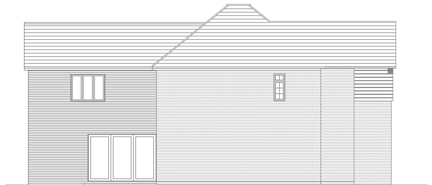
Proposed Flank Elevation