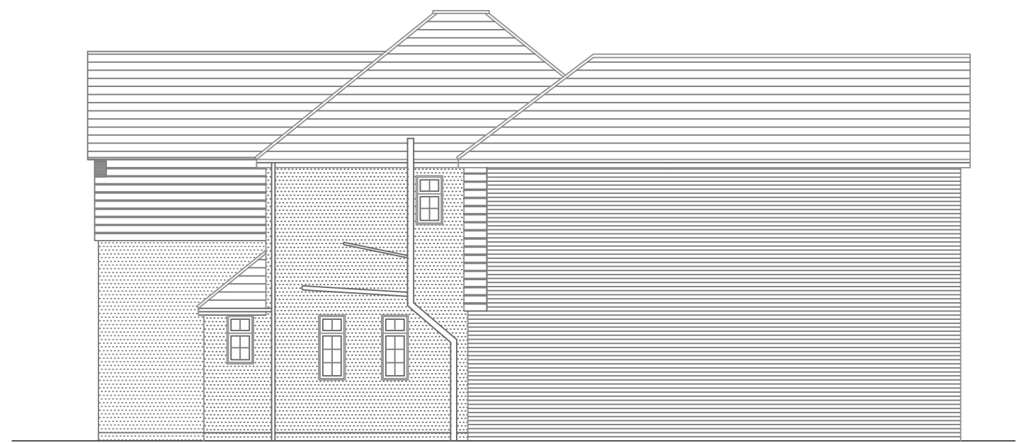
Proposed Flank Elevation